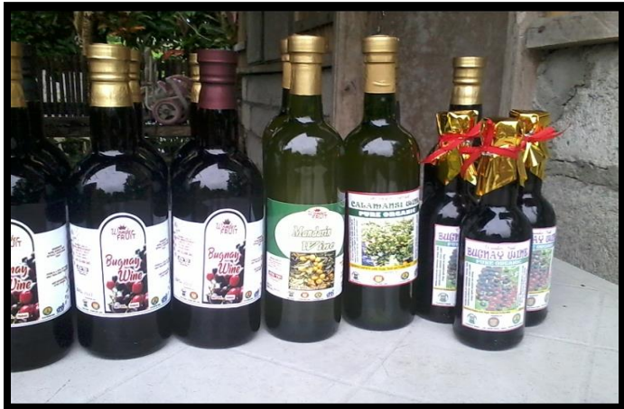
RIC Benito Soliven –Vegetable production and Fruit Wine Processing.