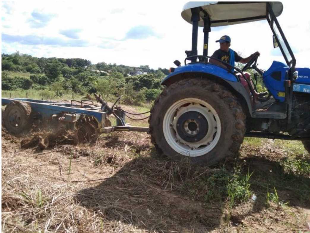
Conducted Land preparation for High Value crop production