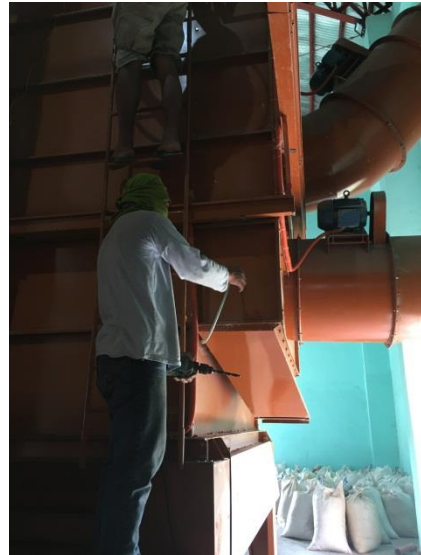
Positioning of thermocouples in the drying chamber (left) and plastic tube in the plenum chamber (right).