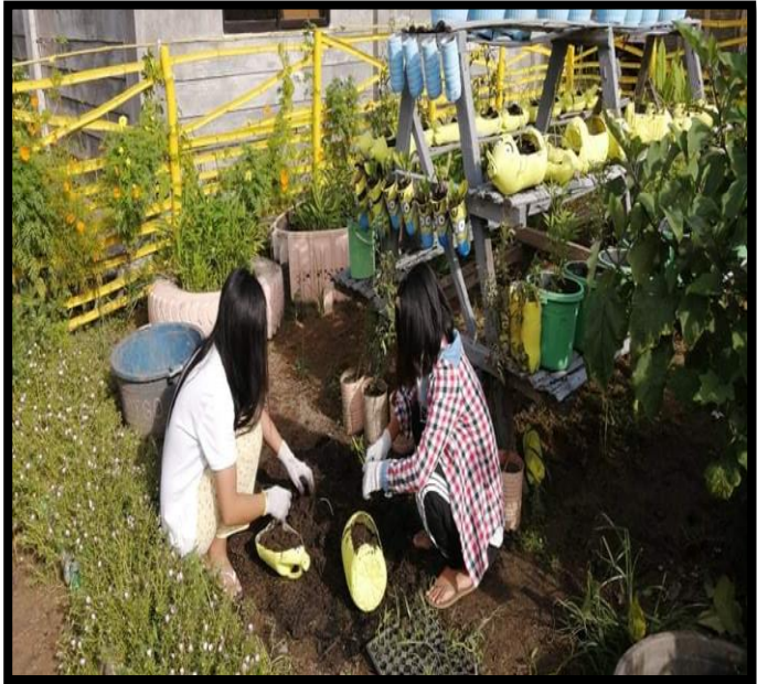
VEGETABLE PRODUCTIONOF QUIRINO YOUTH IN ACTION