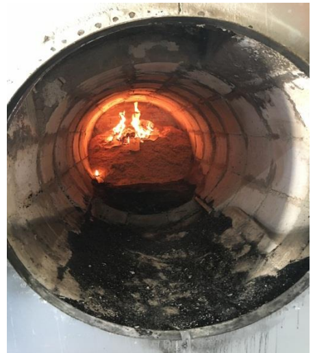
Weighing all the rice hull fuel to be use in the testing (left) and initial firing of rice hull fuel in the burning chamber of the furnace (right).