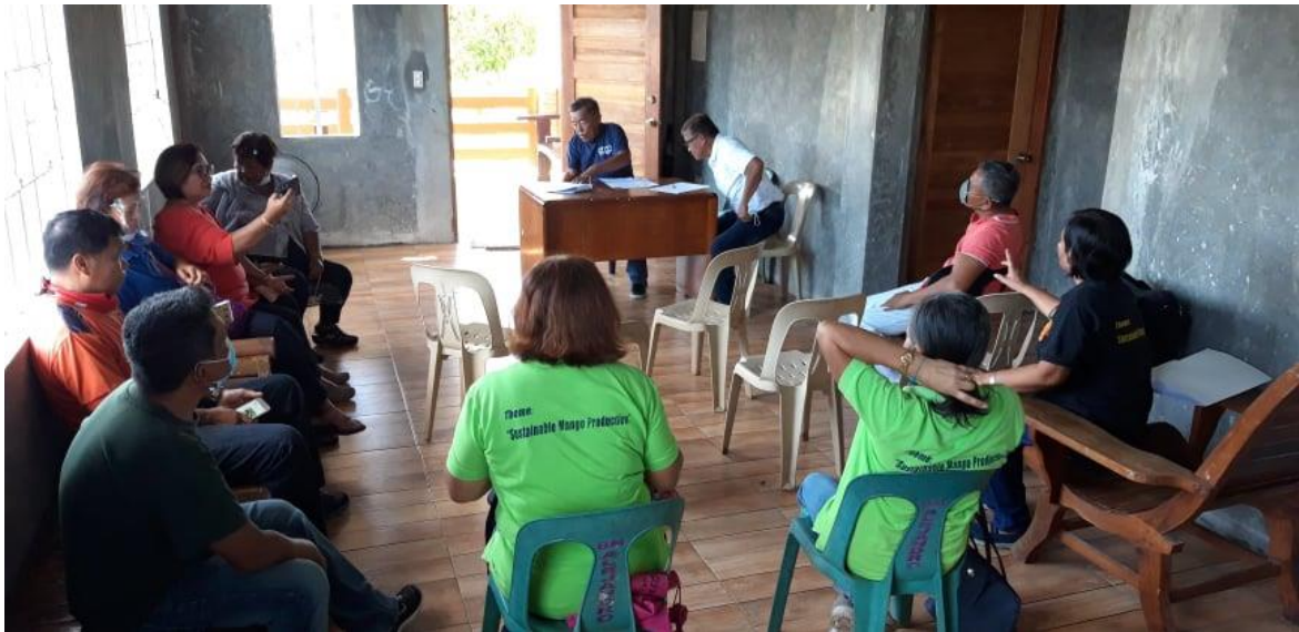
Assisted and facilitated in the first General Assembly meeting of the Queen Isabela Mango Producers Cooperative