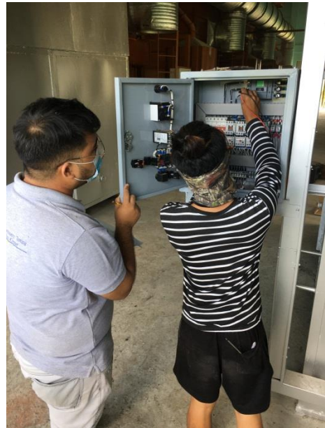
Testing of moisture content of sample (left) and measuring the current use of the dryer (right).