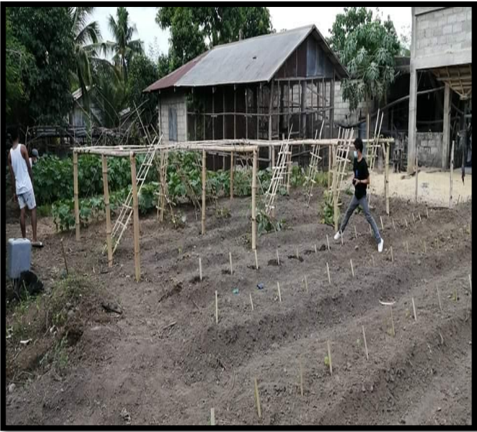
VEGETABLE PROJECT OF 4H CLUB MEMBERS AT STA. MARIA, ISABELA