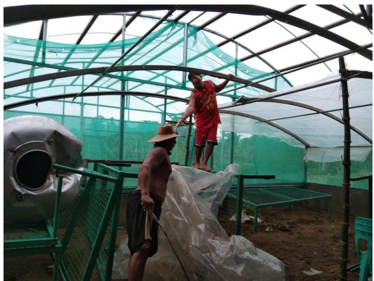
Repaired the damaged green house at the new Provincial Plant Nursery to continue the production of assorted vegetable seedlings.