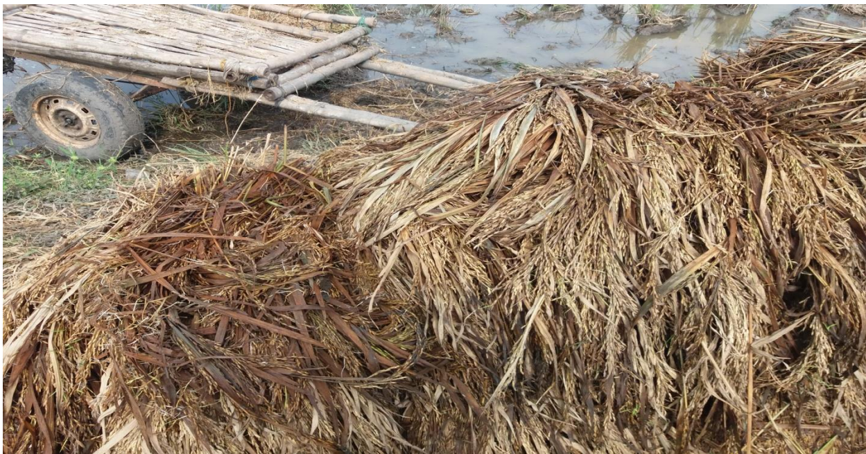
Quality of grain is affected due to lodging of rice plants during the typhoon