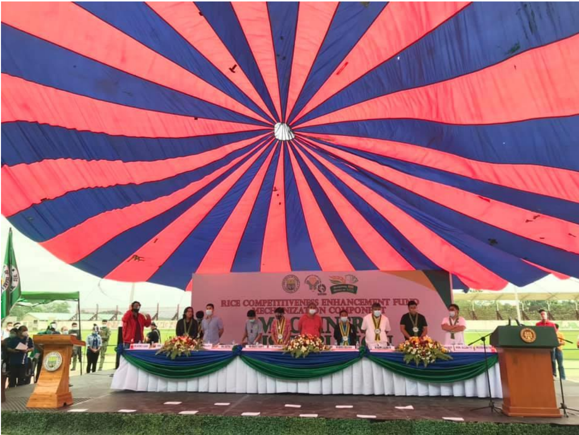
Assisted and Facilitated in the Agricultural Machinery Distribution in the Province of Isabela