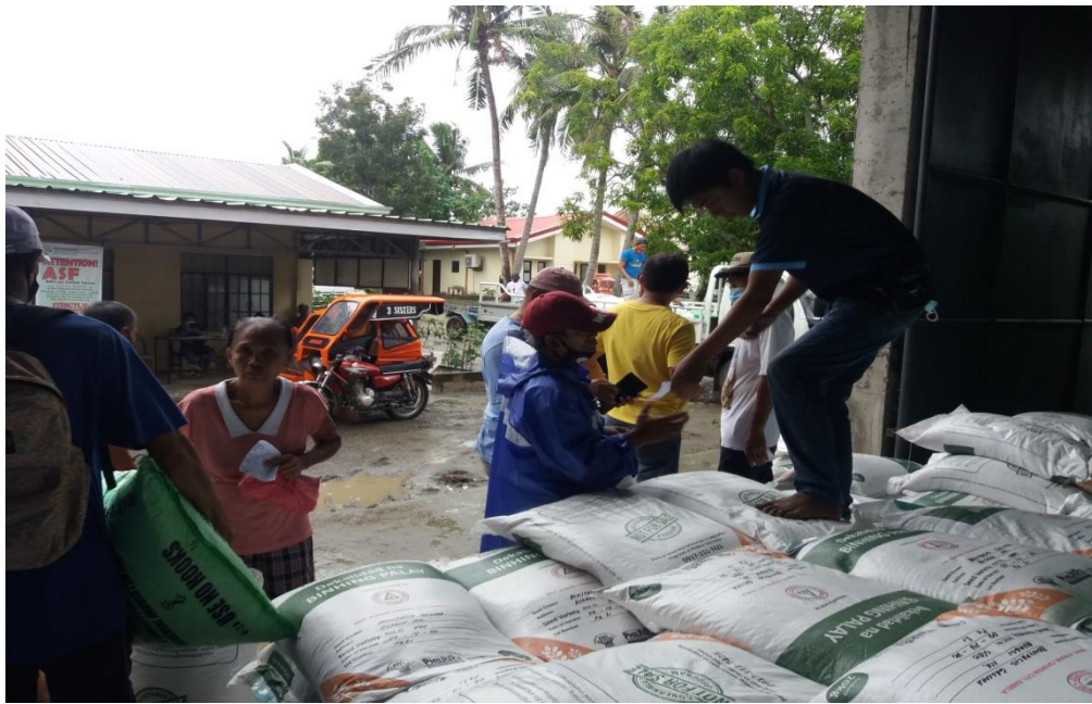
Monitored and assisted in the distribution of seeds for Dry Cropping Season 2020-2021