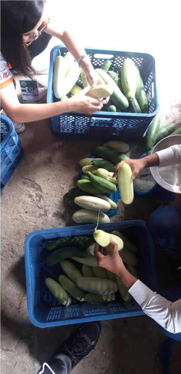
Harvested last priming of Pipino applied with different organic fertilizers