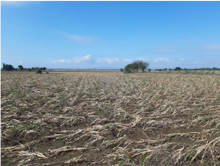
Validation of Corn Damage caused by Typhoon Rolly and Ulysses with DA-CVRC staff and concerned LGUs in the province of Isabela on November 3 – 6, and November 16-19, 2020.