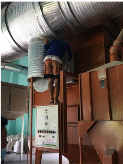
Positioning of thermocouples in the furnace ducting chamber (left) and drying bin entry chamber (right).