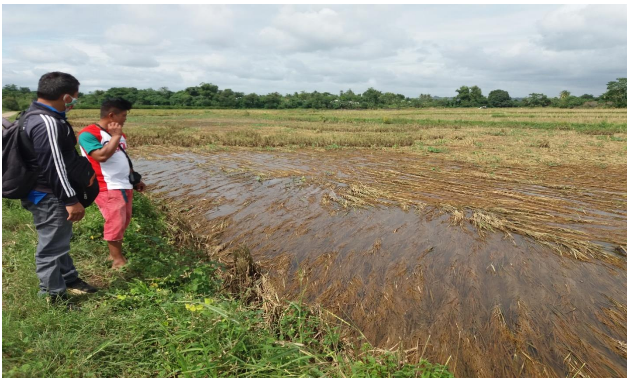
Validated ricefield areas with standing crops damaged by super typhoon Rolly