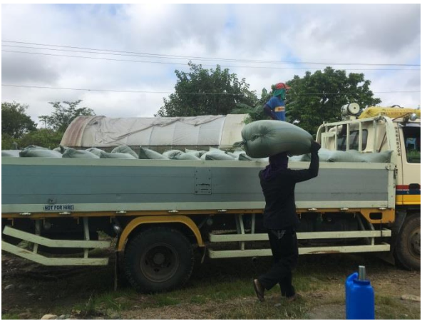
Loading of dried palay from the dryer to an elf truck ready for selling.