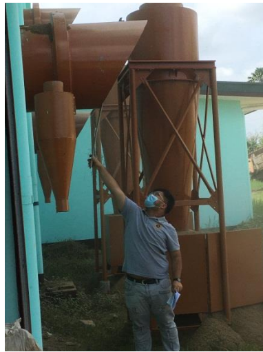
Collecting samples for measuring MC (left) and measuring the air velocity at the blower outlet (right).