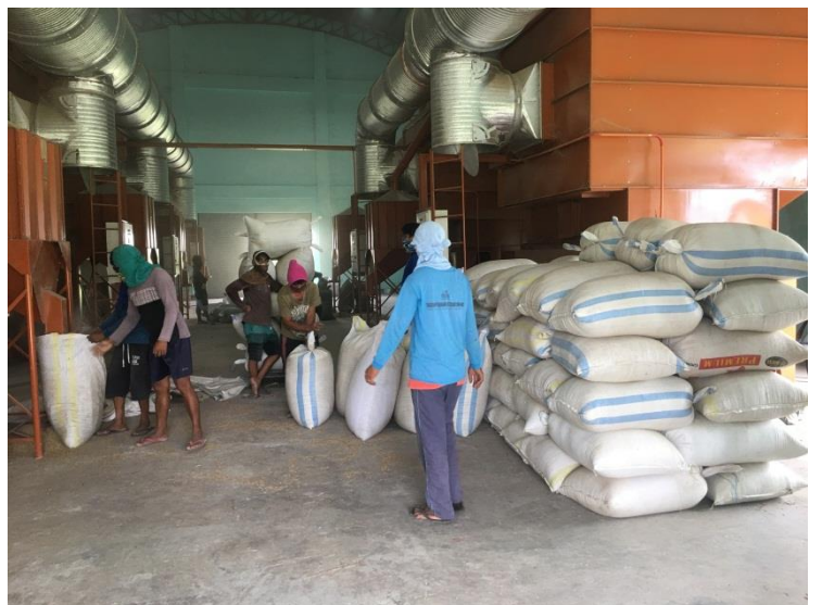
Discharging and bagging of dried palay after testing.