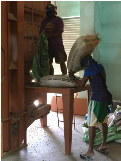
Unloading of rice samples from a forward truck and loading of samples to the mechanical dryer