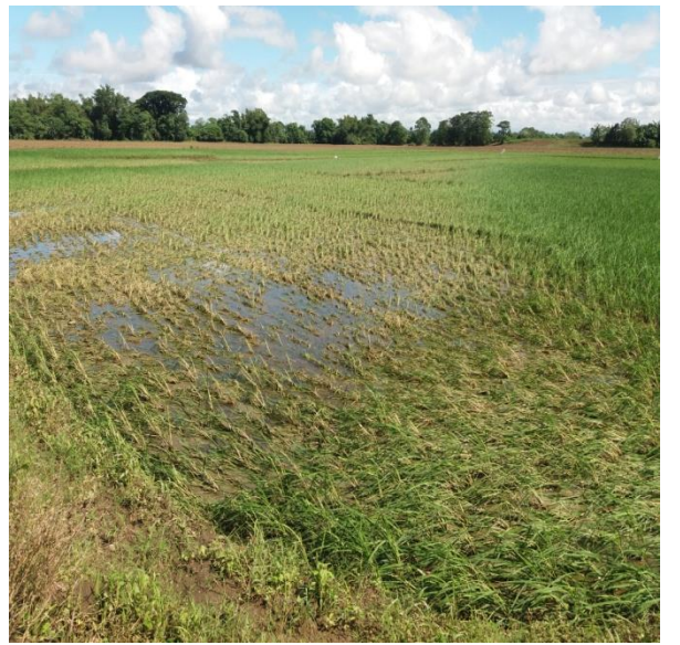
Validation of rice crop damaged due to Northeast Monsoon