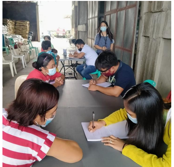
Profiling of Pilot FCAs under Corn and Cassava Commodity by the Department of Agriculture with OPA staff in the province of Isabela on December 18,23 and 29, 2020 at Blue Circle Grains Trading Agricultural Cooperative in brgy. Narra, Echague, EZPERANZA MPC in brgy. Esperanza East, Aurora and Villa Luna MPC in brgy. Villa Luna, Cauayan City, Isabela.