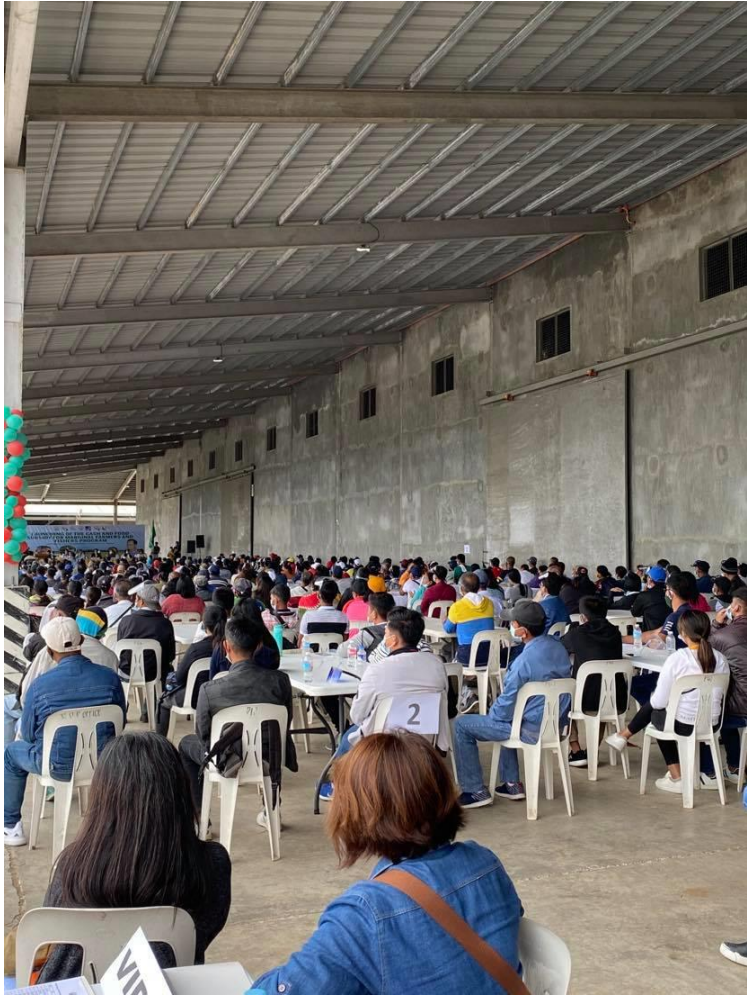
Assisted and Facilitated in the conduct of graduation ceremonies of Season-long Farmers' Field School and oath taking of officers of Queen Isabela Mango Producers Cooperative for Selected Mango Growers of Isabela at Barangay Labinab, Cauayan City, Isabela on December 18, 2020.