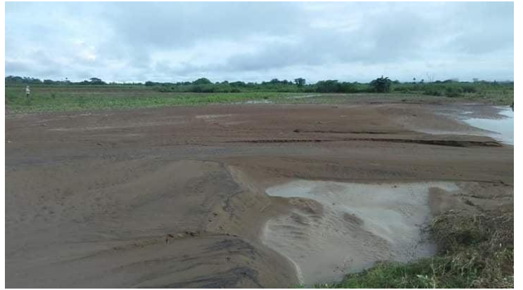
Validation on the extent of corn damage caused by “ Monsoon Rain” ( Tropical Depression Vicky) in the province of Isabela on December 23-24, 2020.