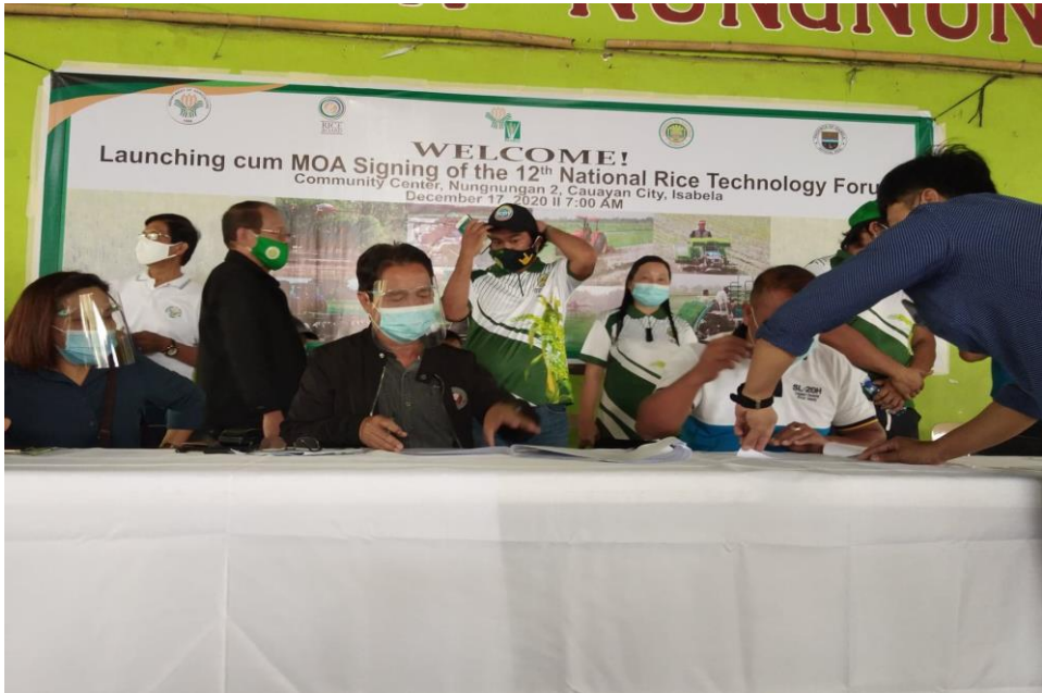
Launching of the 12th National Rice Technology Forum (NRTF) and Memorandum of Agreement signing