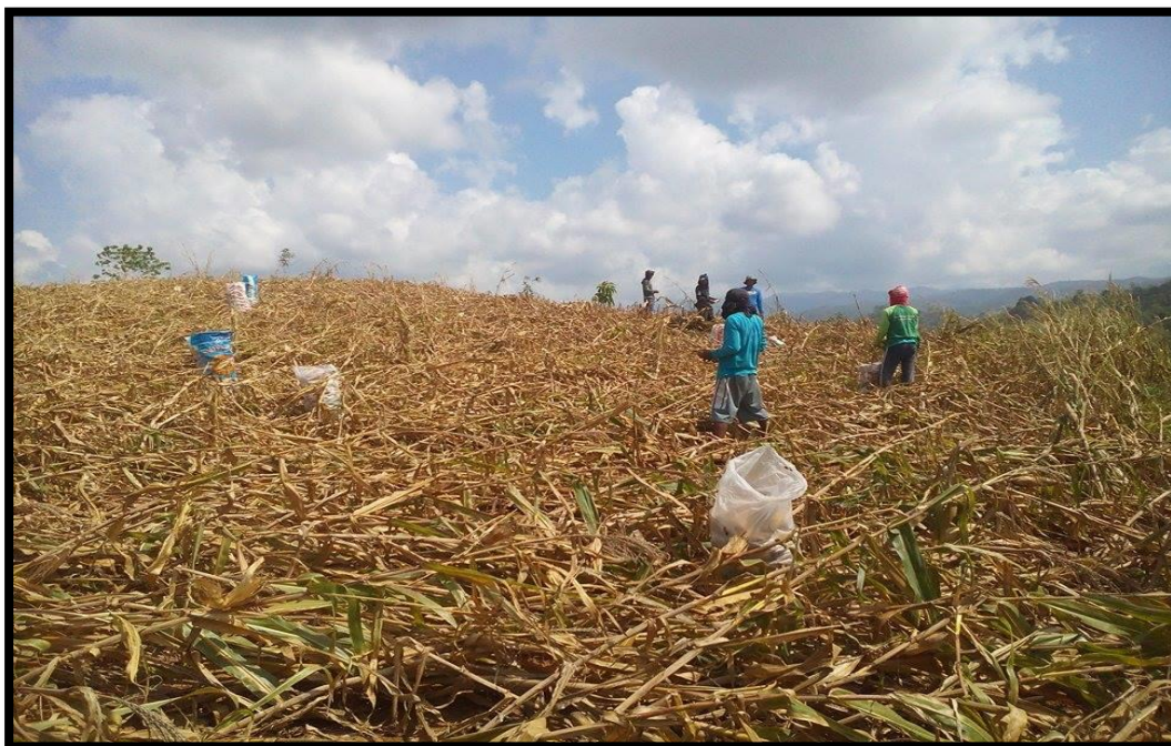
Harvesting of corn crops of SCOPSA Technology Demonstration Project established at City of Ilagan, Isabela