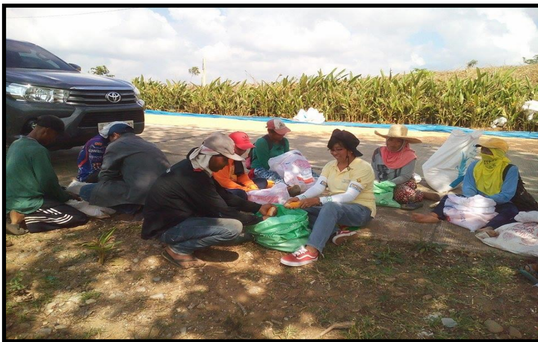
Yield Data and moisture content determination of corn crop produce obtained from SCOPSA sites