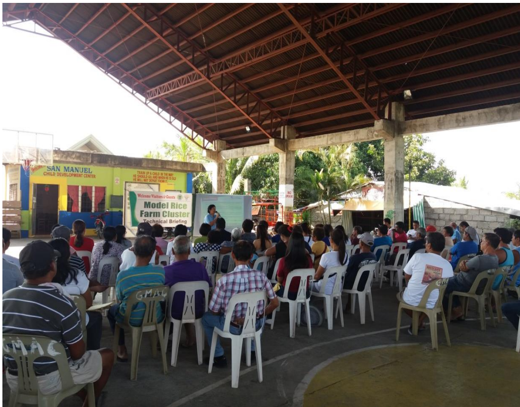
Facilitated during the conduct of Technical Briefing on Hybrid Rice Production