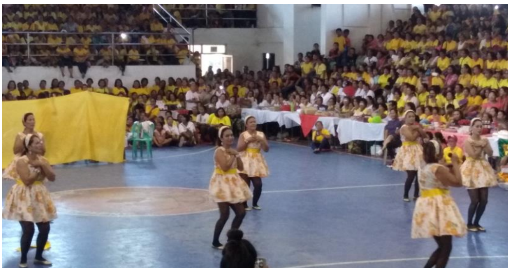
3 rd place is Naguilian, Isabela