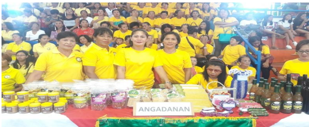
Angadanan 2 nd Place in the Product display competition.