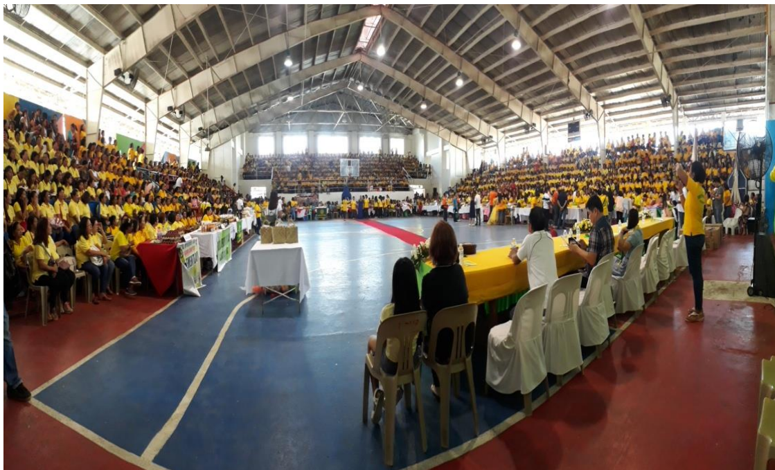
A total of 2,991 delegates comprising of various RIC officers and members, City/Municipal Agriculturist and Coordinators participated in the event