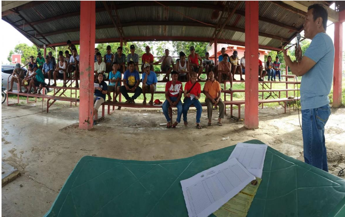
Attended Farmers' Meeting and discussed the guidelines of the High Yielding Technology Adoption (HYTA)