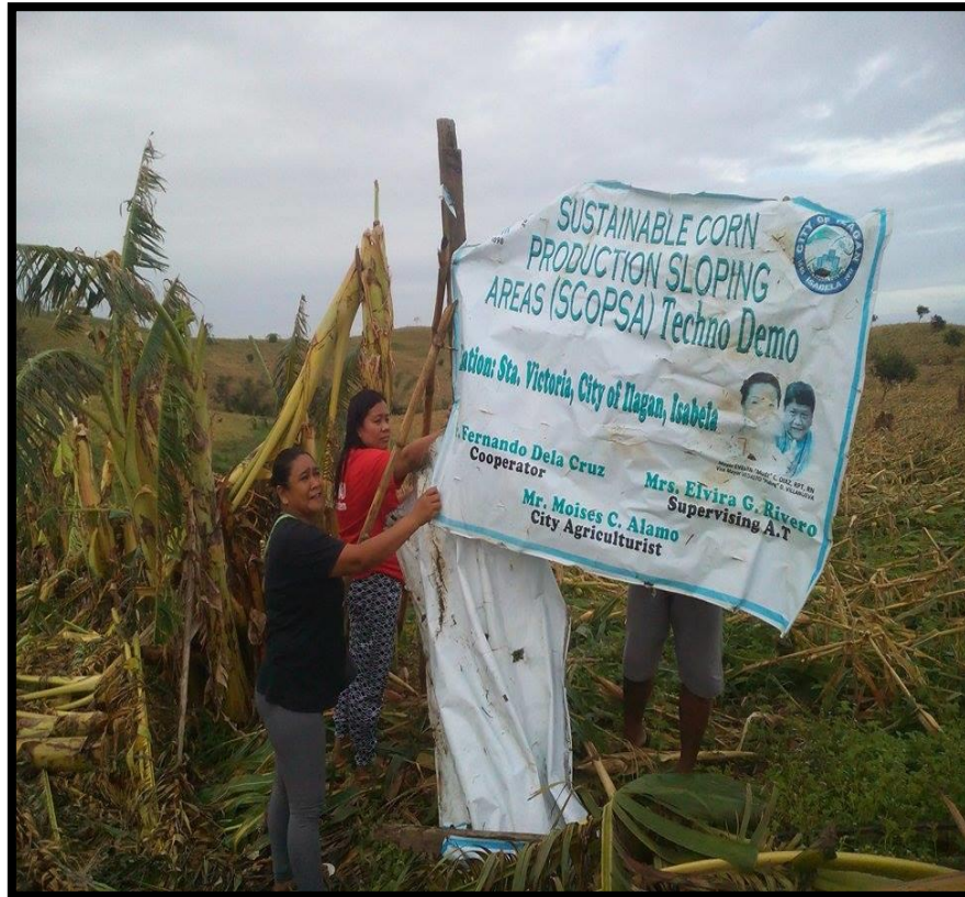
Processing the Production Data per hectare thru crop cut by concerned AEW's and farmers at 3 SCoPSA Demo Sites in Sta. Victoria and San Lorenzo, City of Ilagan, Isabela on October 10, 2018.