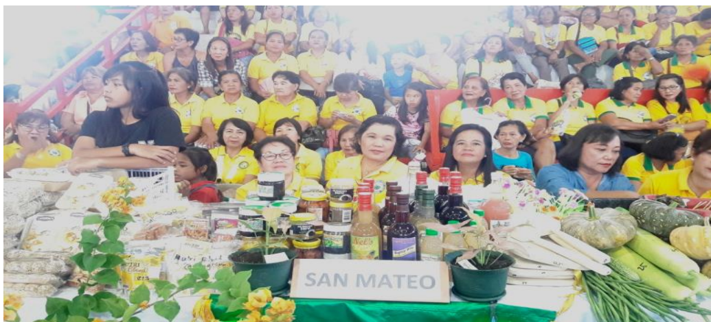
RIC San Mateo 3 rd Place in the Product display competition.