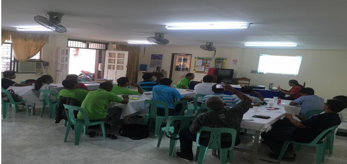
The Provincial Agriculture and Fishery Council (PAFC) hold its regular meeting to tackle issues and concerns relating to agriculture and fishery development of the province. The meeting was conducted on July 24, 2018 at the Office of the Provincial Veterinarian.