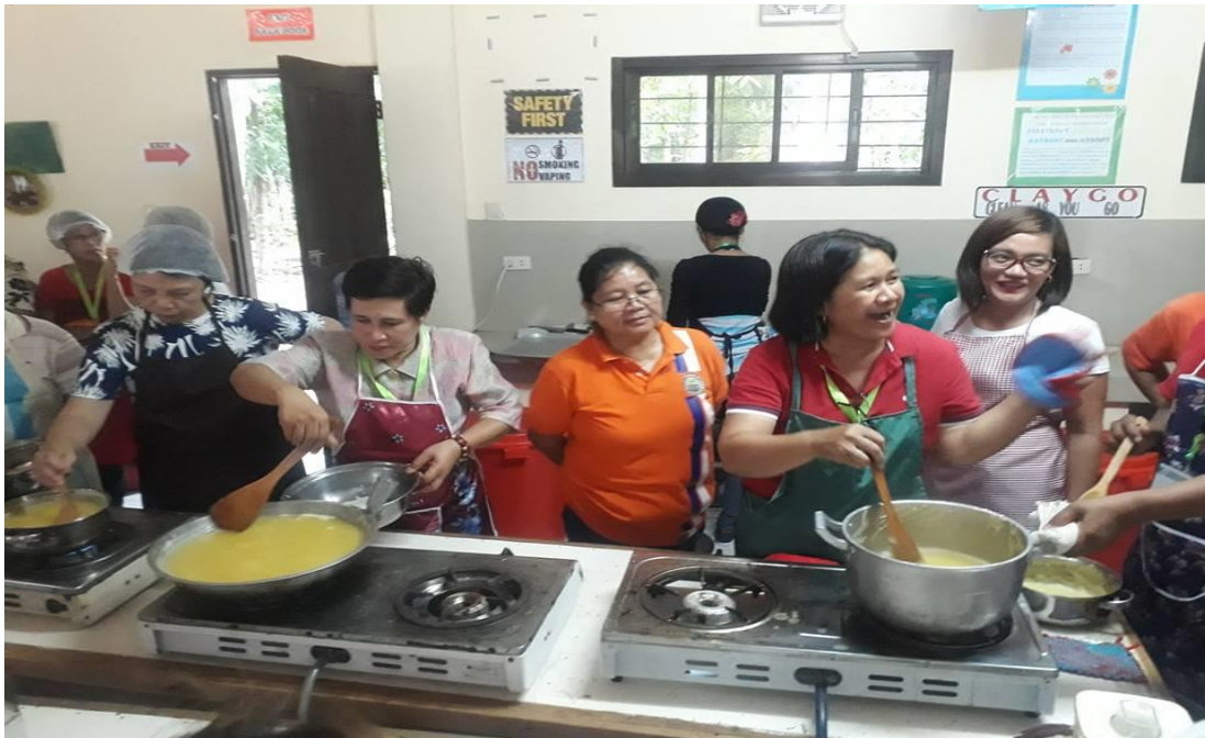
OPA Staff acted as Facilitator in the conduct of training on Food Processing with Quality and Food Safety Management and NC II Assessment which was participated by 47 RIC members and vegetable growers of the Participatory Guarantee System Group