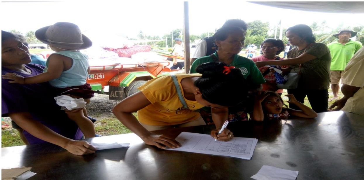
Distribution of assorted vegetable seedlings during the Farmers Congress at Palanan, Isabela spearheaded by the OPA Staff