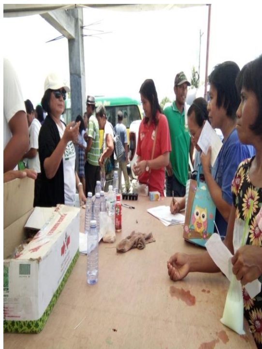
The OPA Staff took part in the distribution of assorted vegetable seedlings during the Farmers Congress conducted at Burgos, Isabela