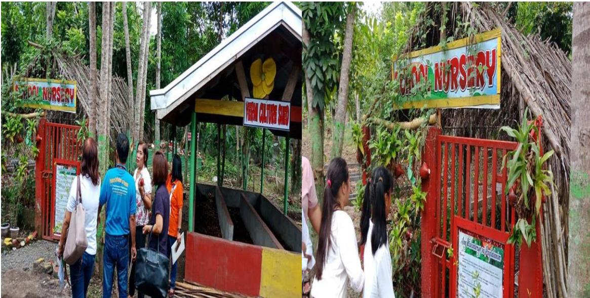
The OPA Provincial 4H Coordinator joined the Launching of 4H Garden in the School of Gamu Central School and Oath taking Ceremony of the newly elected 4H Juniors Officers on July 18, 2018.