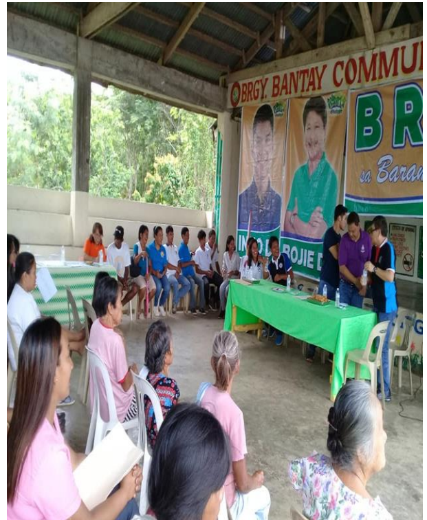
OPA Staff facilitated the BRO Farmer's Congress sa Barangay at Brgy. Bantay, Jones, Isabela on July 18, 2018