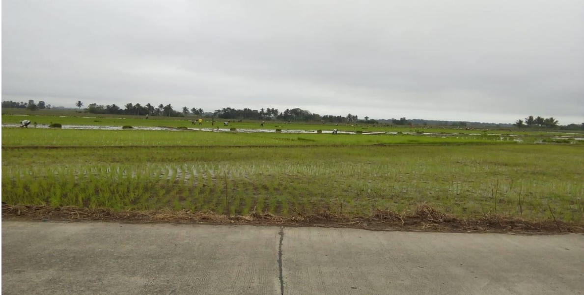
Monitored planting activity under the High Yielding Technology Adoption (HYTA)