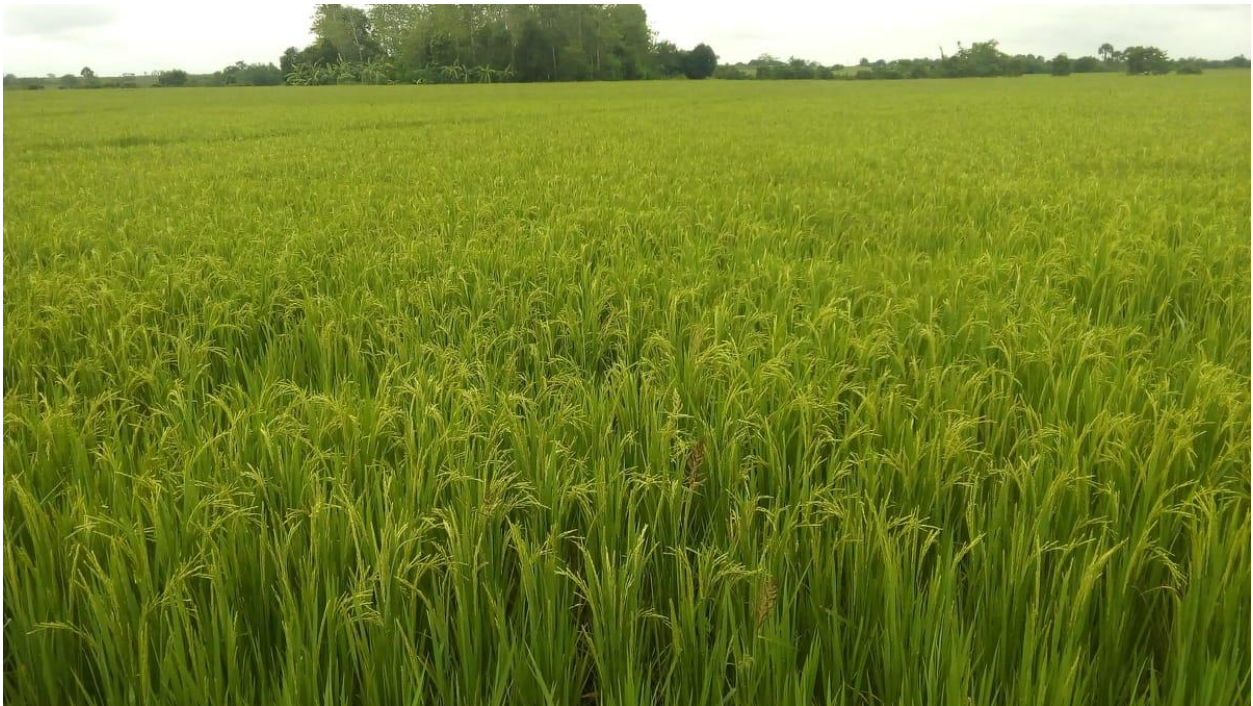
Monitored status of crop stand under the Model Rice Farm Cluster in Gamu, Isabela