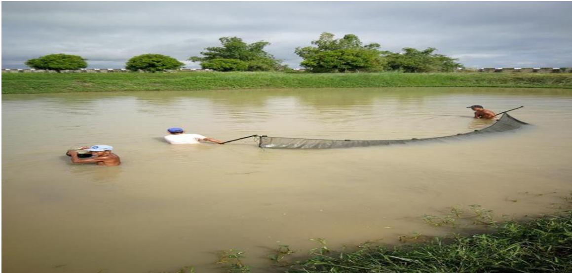
Collection of tilapia fingerlings at San Pablo Fish Farm for distribution to backyard fishpond and communal bodies of water