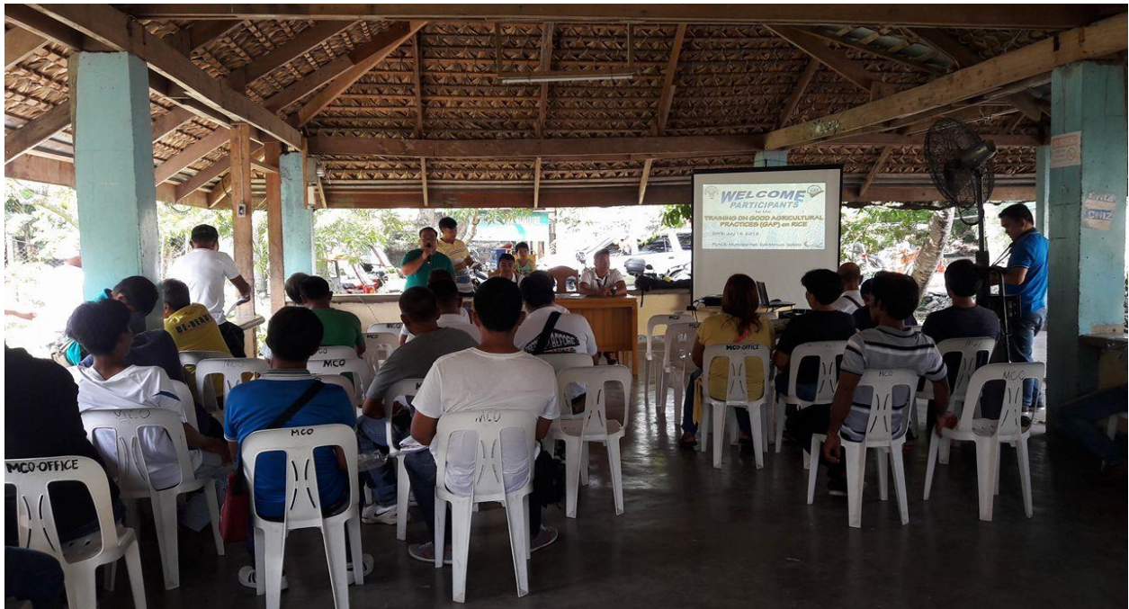
Facilitated and served as resource speaker during the training of Good Agricultural Practices (GAP) on Rice production held at San Manuel, Isabela