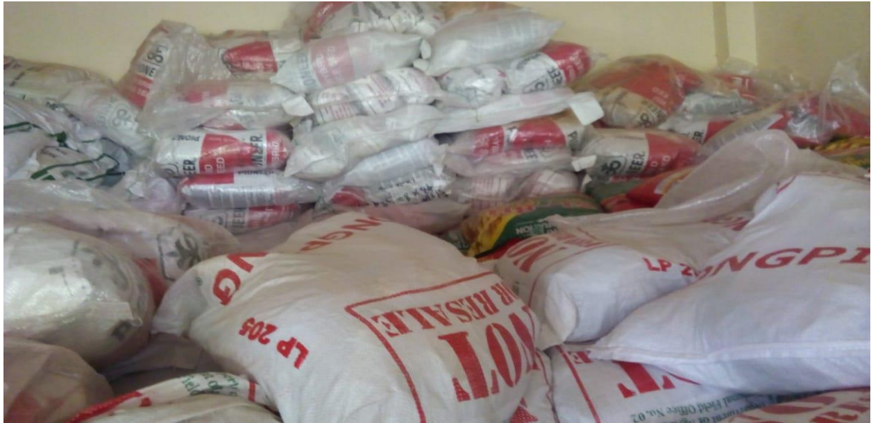
Monitored withdrawal of seeds from the warehouse ready for distribution to eligible farmer-beneficiaries