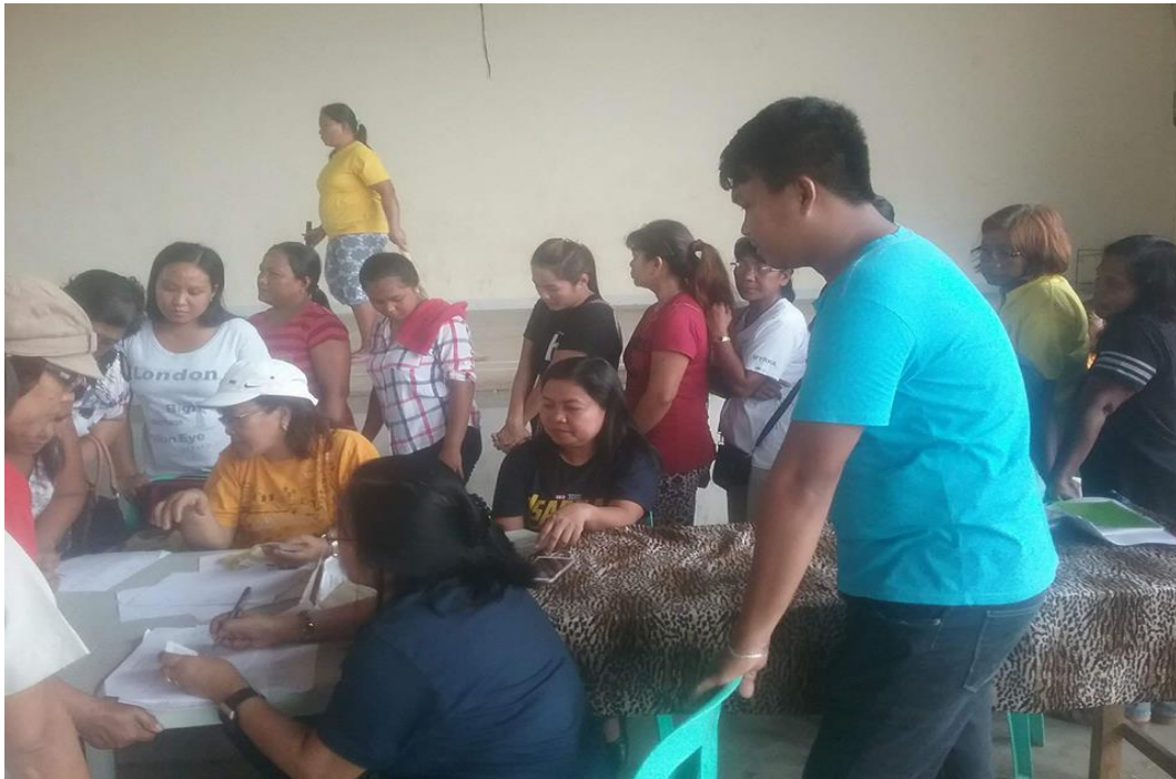
The OPA Staff conducted enrolment of RIC members of Mabini, Gamu, Isabela to AFP-Gen Life Insurance, a Provincial Government program providing free insurance premium to Isabeleno beneficiaries