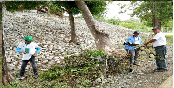
THE PROVINCIAL AGRICULTURIST OFFICE joined the provincewide clean up drive operation in observance of the PDRRM Day on July 20, 2018 in preparation for the typhoon months / season . Isabela Sports Complex Compound was designated to the office as area of assignment.