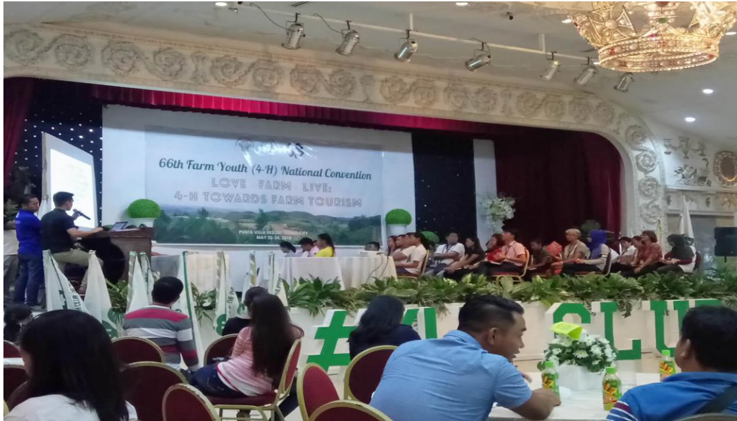
Quiz Bee participated by Isabela province during the 66 th Farm Youth (4H ) National Convention held at Punta Villa Resort, Iloilo City