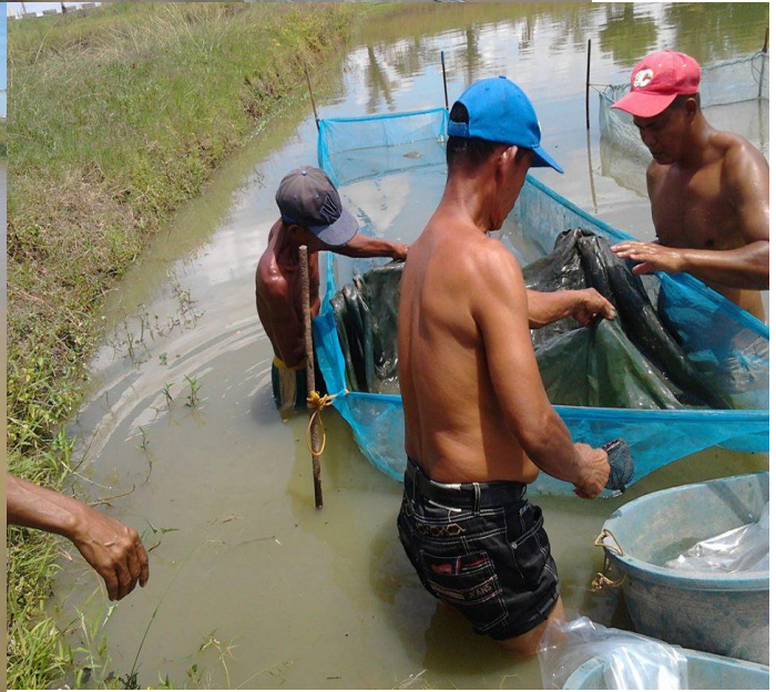
Collection and packing of tilapia fingerling for dispersal to various requesting clients of the PGIs fishery facility