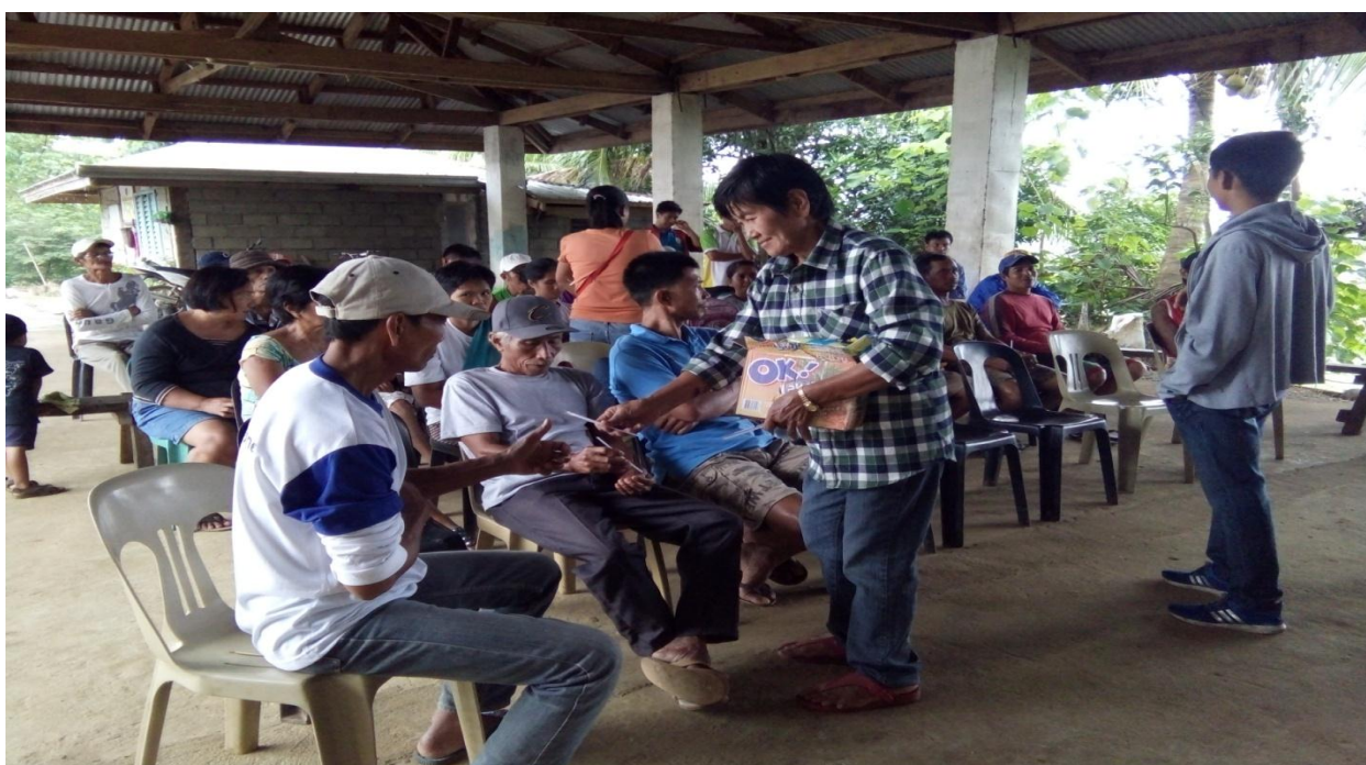
At San Guillermo, Isabela