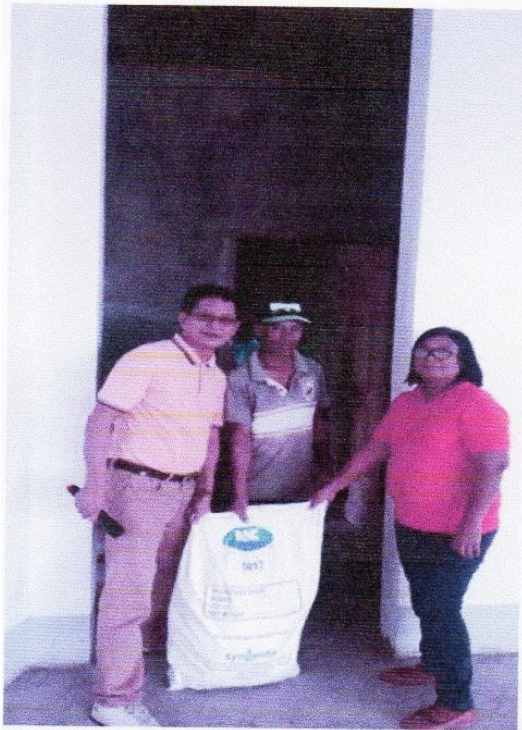
Ceremonial distribution of seeds for the model Rice Farm Cluster