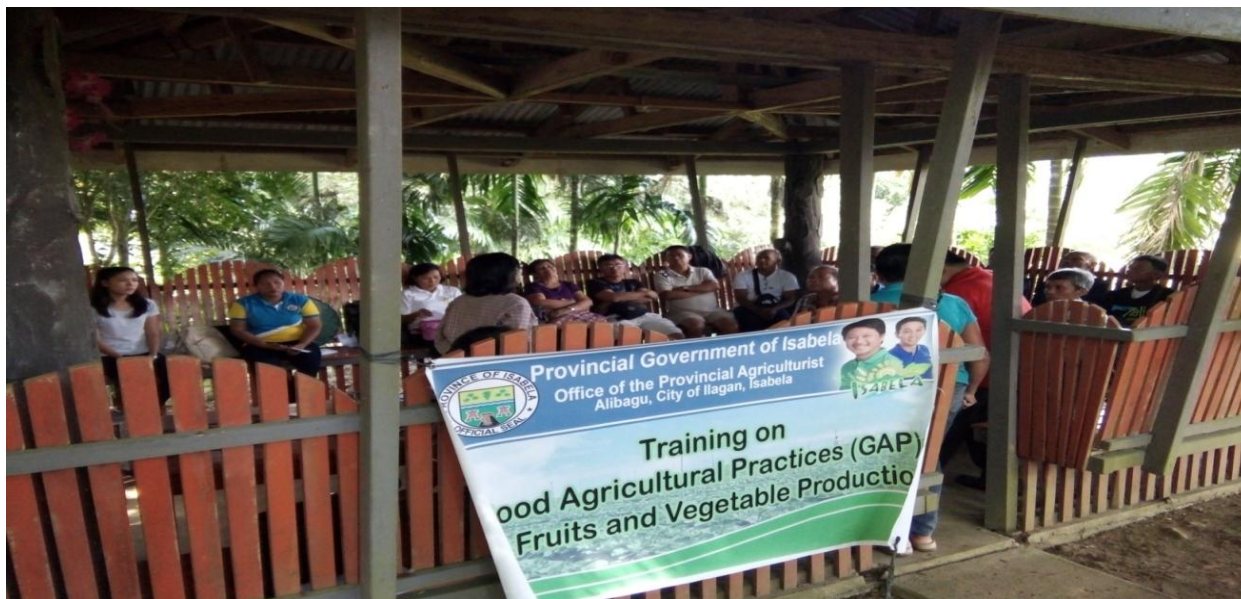
Training conducted on Good Agricultural Practices for Fruits and Vegetables at Jones, Isabela