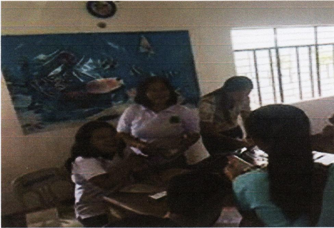
Enrollment of AFP-Gen Life Insurance for Fisherfolk