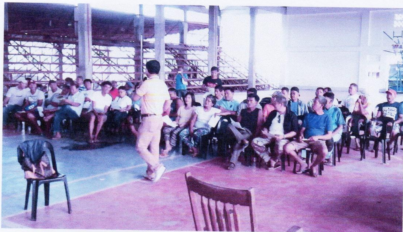
Technical Briefing of farmer-cooperators of the Model Rice Farm Cluster in Burgos, Isabela