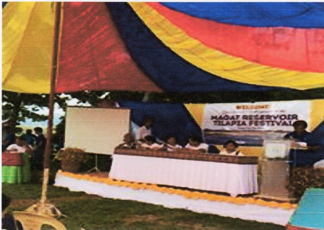
Attendance to Tilapia Festival at Magat Dam Reservoir