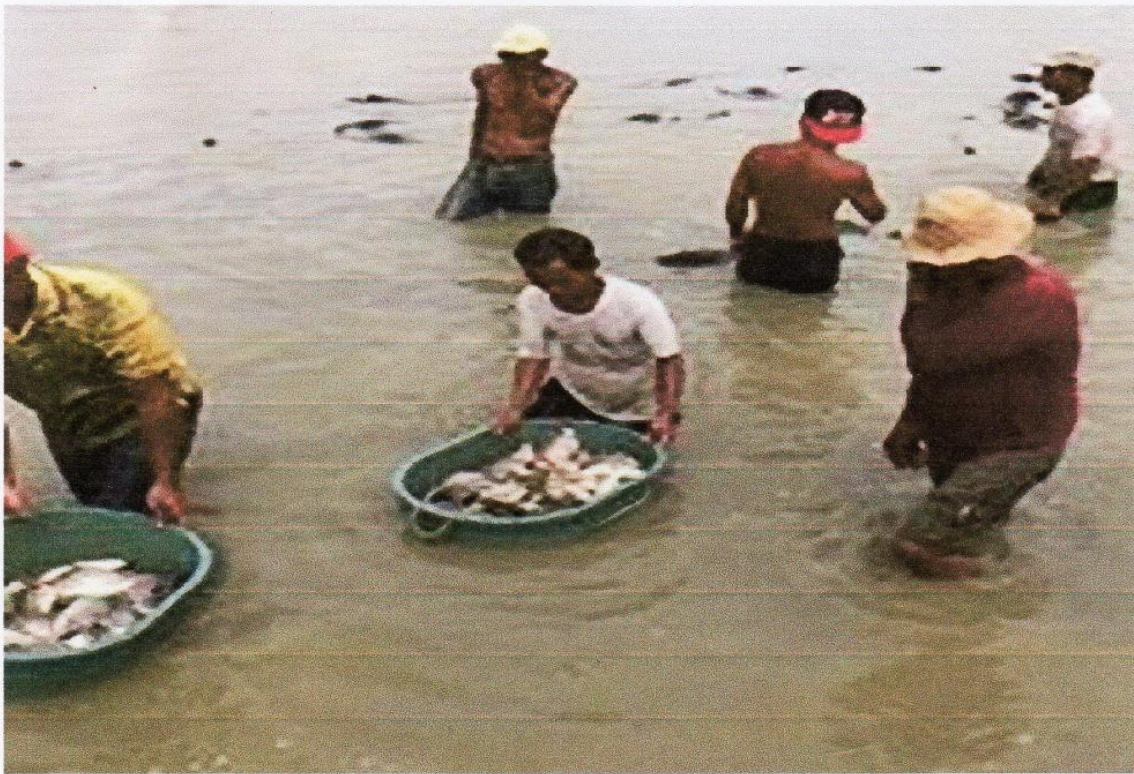
Recovery of breeders after deluge/ inundation of fishponds due to continuous rain