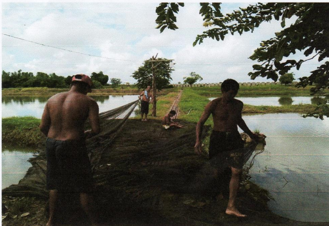
Mending of used nets at San Pablo Freshwater Fish Farm