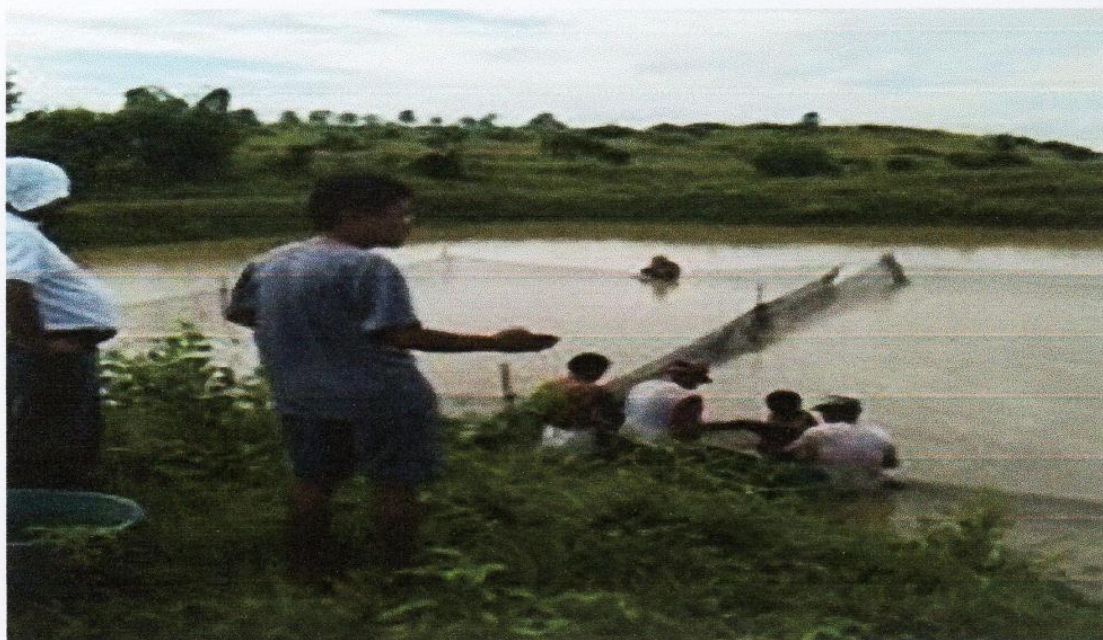
Technical assistance in the management and operation of fish hatchery