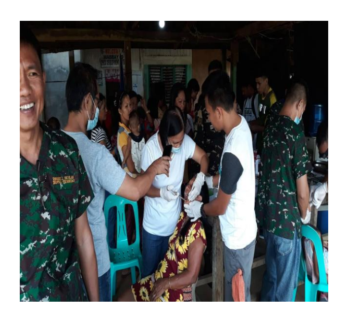
Amidst the dim light, the provincial dentists during tooth extraction at Jones, Isabela