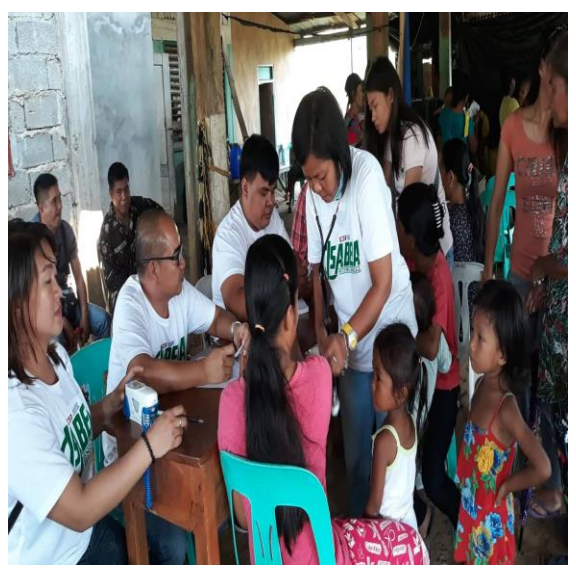
Health workers assess the clients at San Guillermo, Isabela