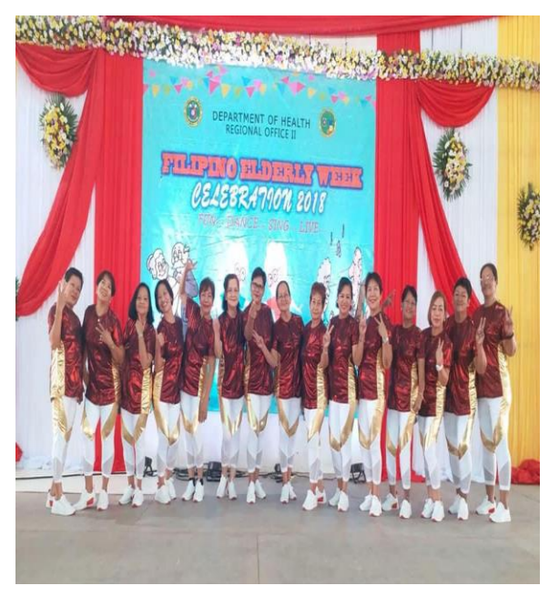
The City of Ilagan emerges as the ZUMBA GOLD CHAMPION