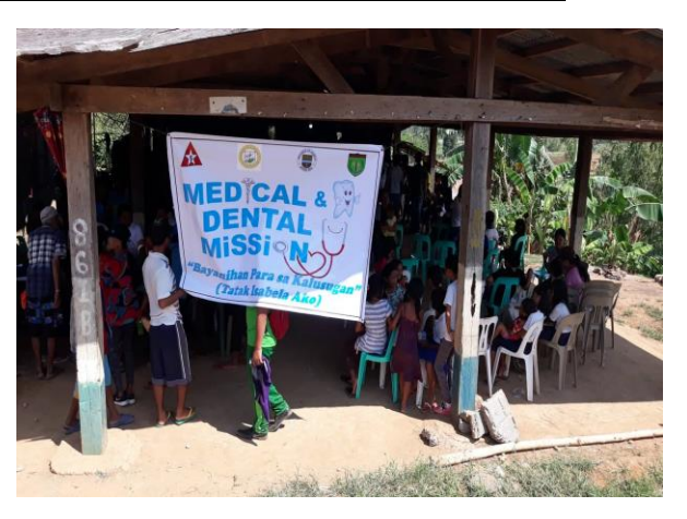
Crowds of people gather around the admission area at Barangay Mabbayad, Echague