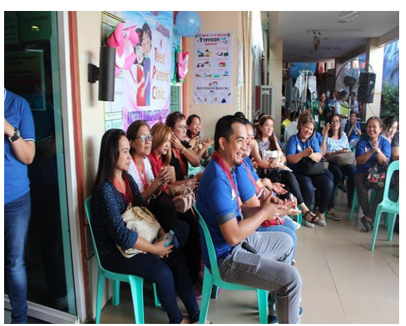
Partners from the DOH-RHO2, LuzonHealth Program, POPCOM region 2 and IPHO family Health Cluster Program Coordinators grace the event.