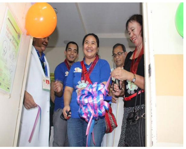
The chief of the SIMC, Luzon Health Partners and a representative from the DOH RHO2 lead the ribbon-cutting ceremony and blessing