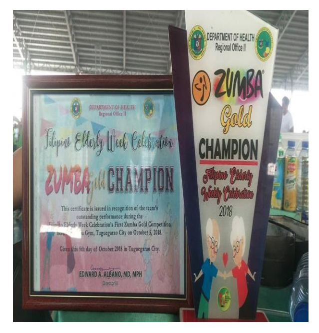
A Plaque and a token await the winner!