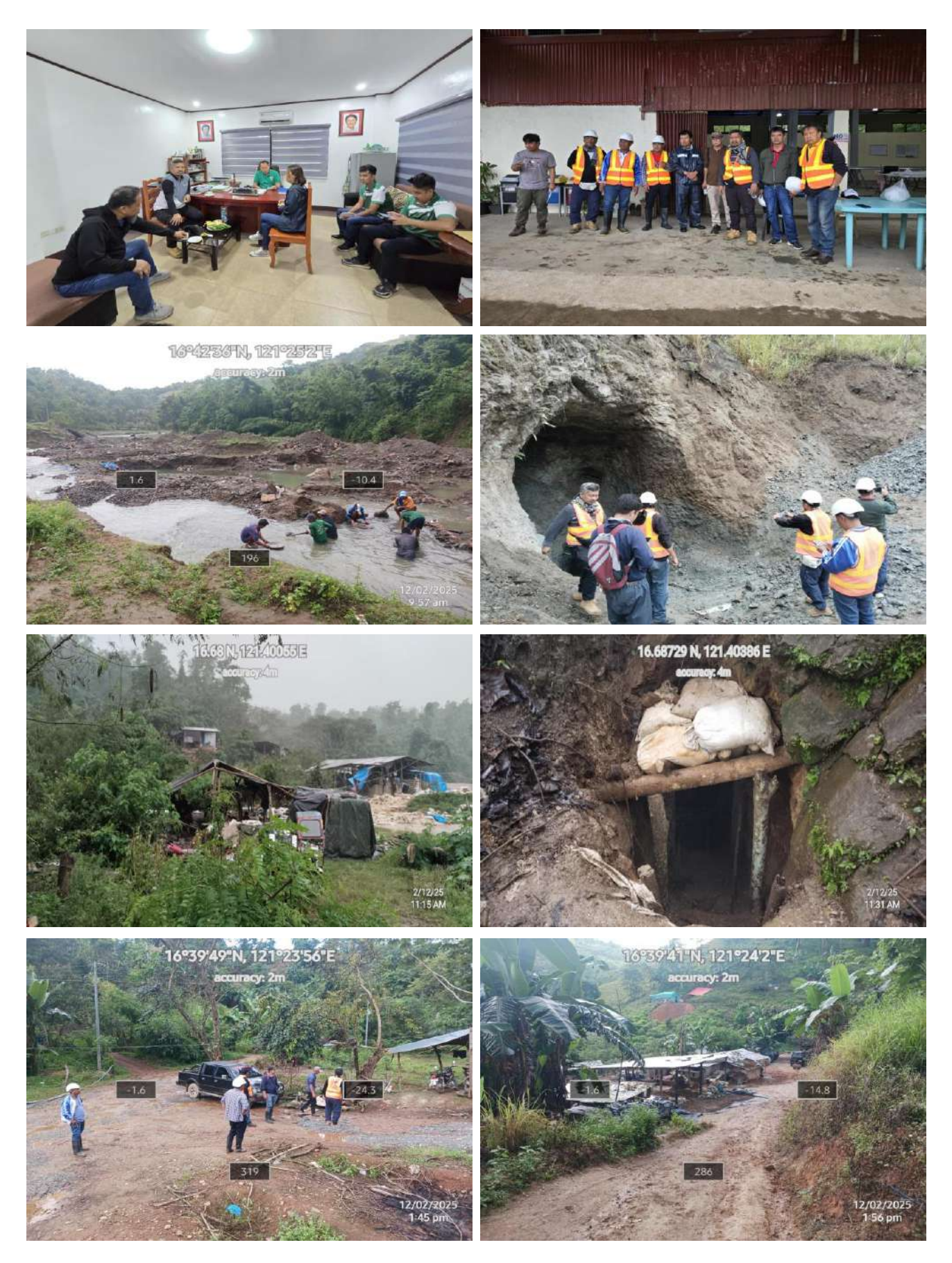
Conduct of inspection of reported illegal small-scale mining operation, and compliance monitoring of issued Cease and Desist Orders, at Cordon, Isabela