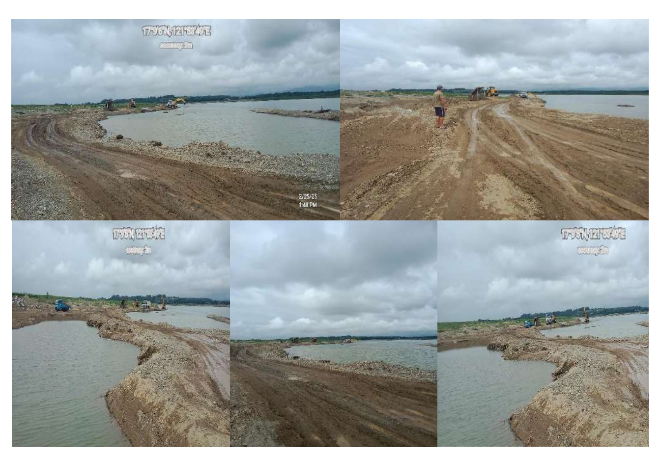
Baculud, City of Ilagan, Isabela

Photos taken during conduct of site verification of applied areas for Commercial Sand and Gravel Permit