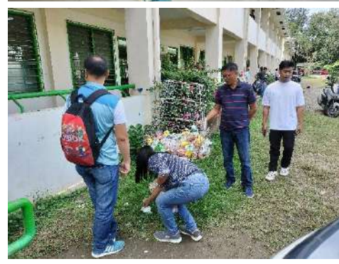
Cabagan Public Market