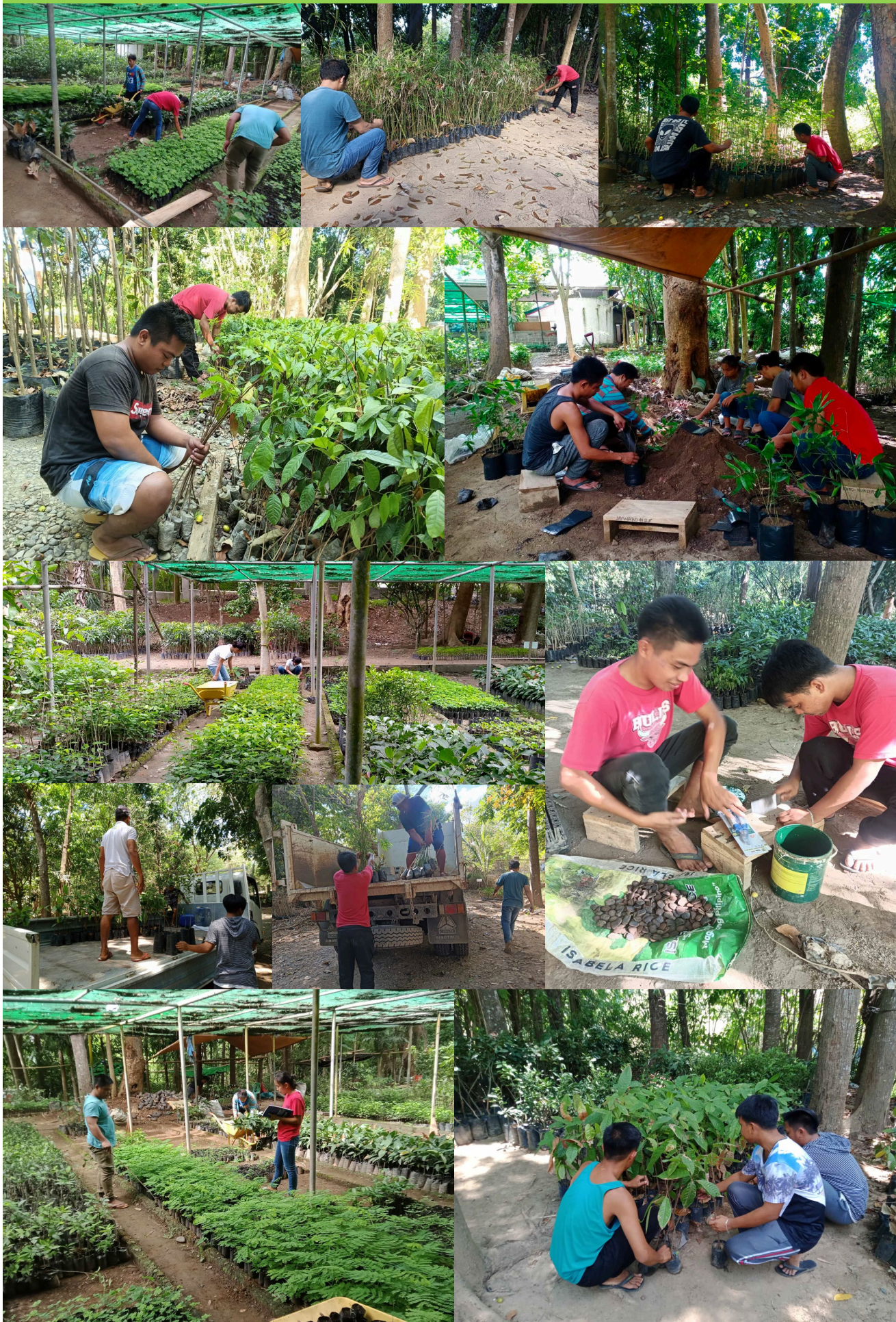
Nursery Operation and Maintenance activities at the ENRO Provincial and Clonal Nursery for the Month of May 2024.