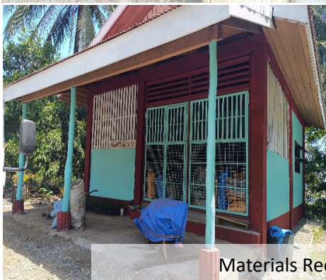
Materials Recovery Facility