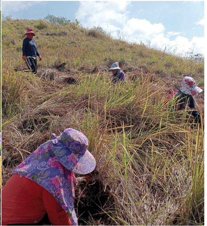
Site preparation activities conducted by the CFW beneficiaries at Delfin Albano, Isabela.