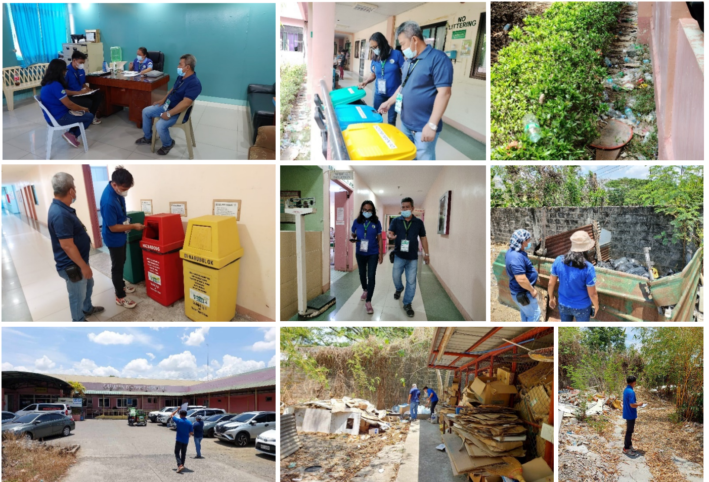
📍 Cauayan City District Hospital