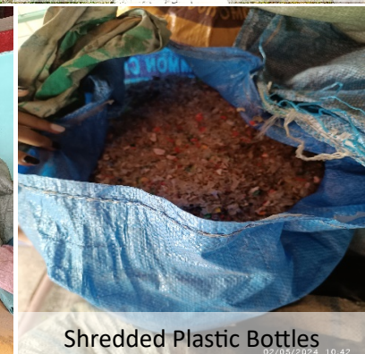
Shredded Plastic Bottles