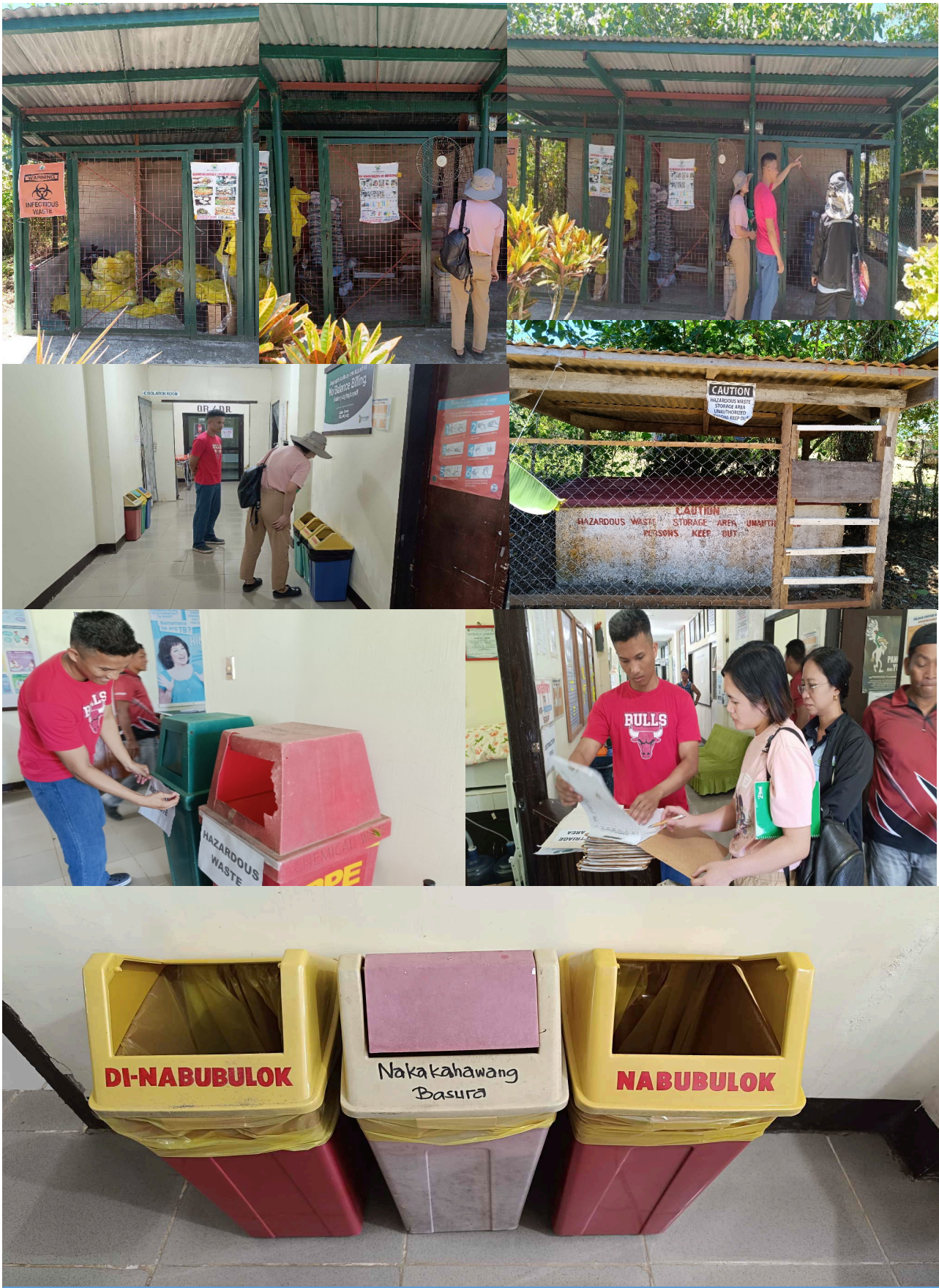
Palanan Extension Hospital