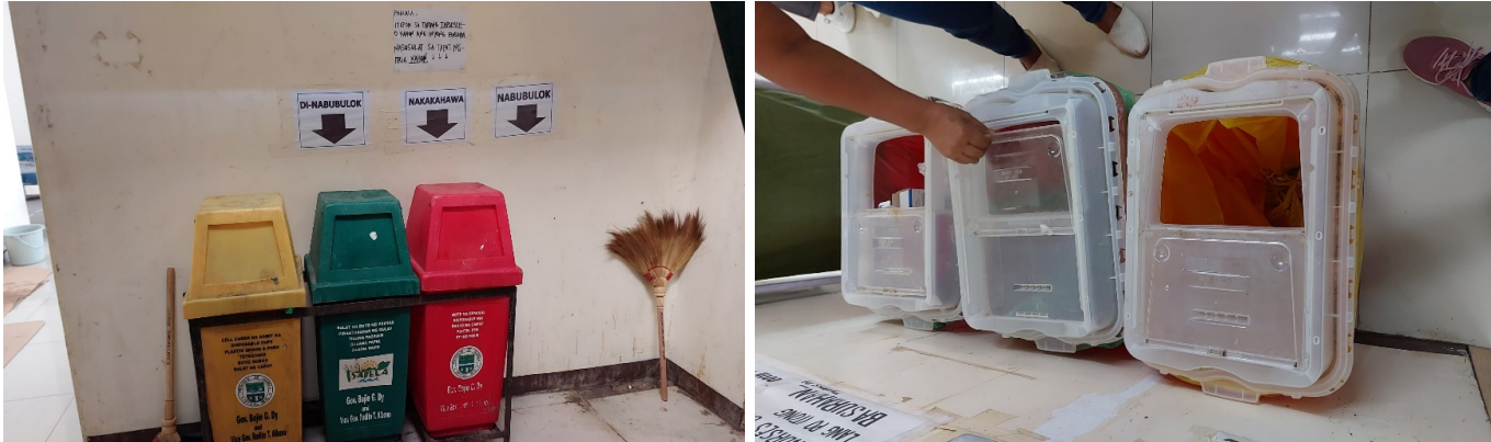
📍 Gov. Faustino N. Dy Sr. Memorial Hospital