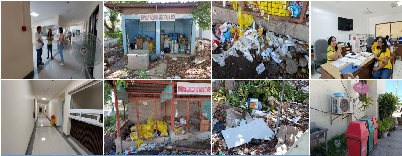
📍 Milagros Albano District Hospital