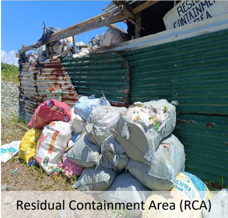
Residual Containment Area (RCA)