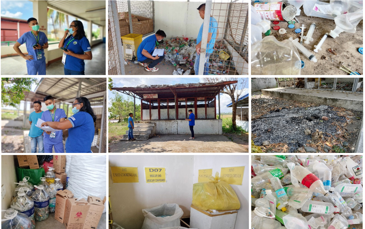
📍 Echague District Hospital