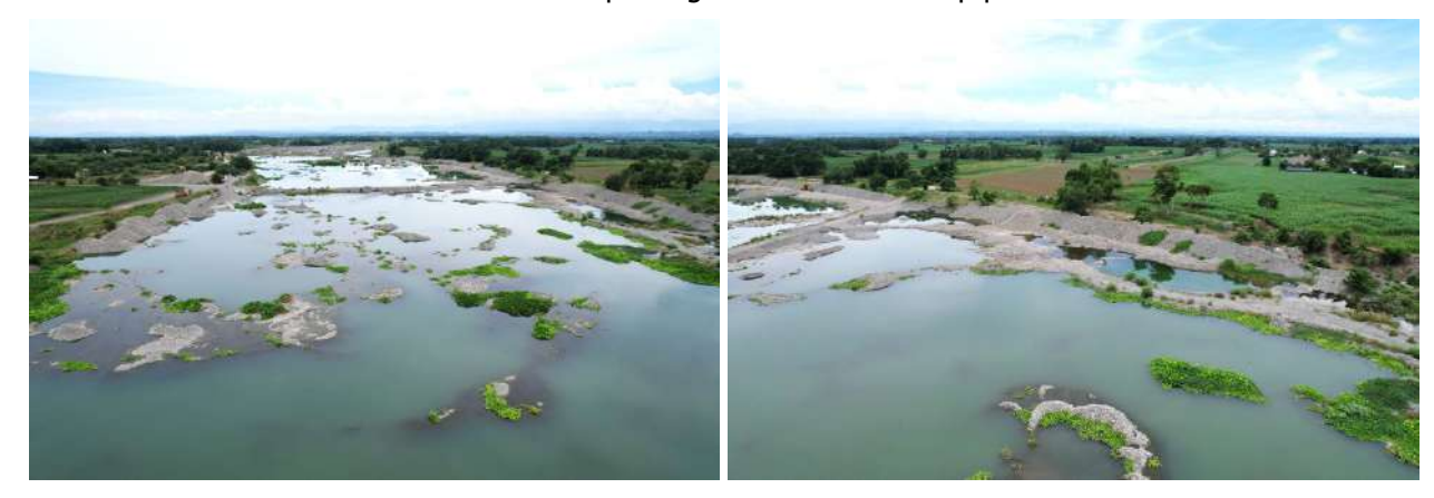
Barangay Culing East: Photos below showing (Left) current state of the river and (Right) the closer view of extraction wastes stocked-up along the riverside as slop protection to the farmlands.

Barangay Culing Centro: Photos below showing (Left) current state of the river and (Right) the closer view of extraction wastes stocked-up along the riverside as slop protection to the farmlands.