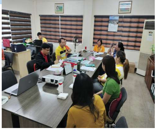
Monitoring and Inspection of Municipal Sanitary Landfill Facilities