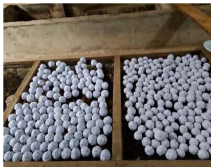
ENR Office Organic Vegetable Garden