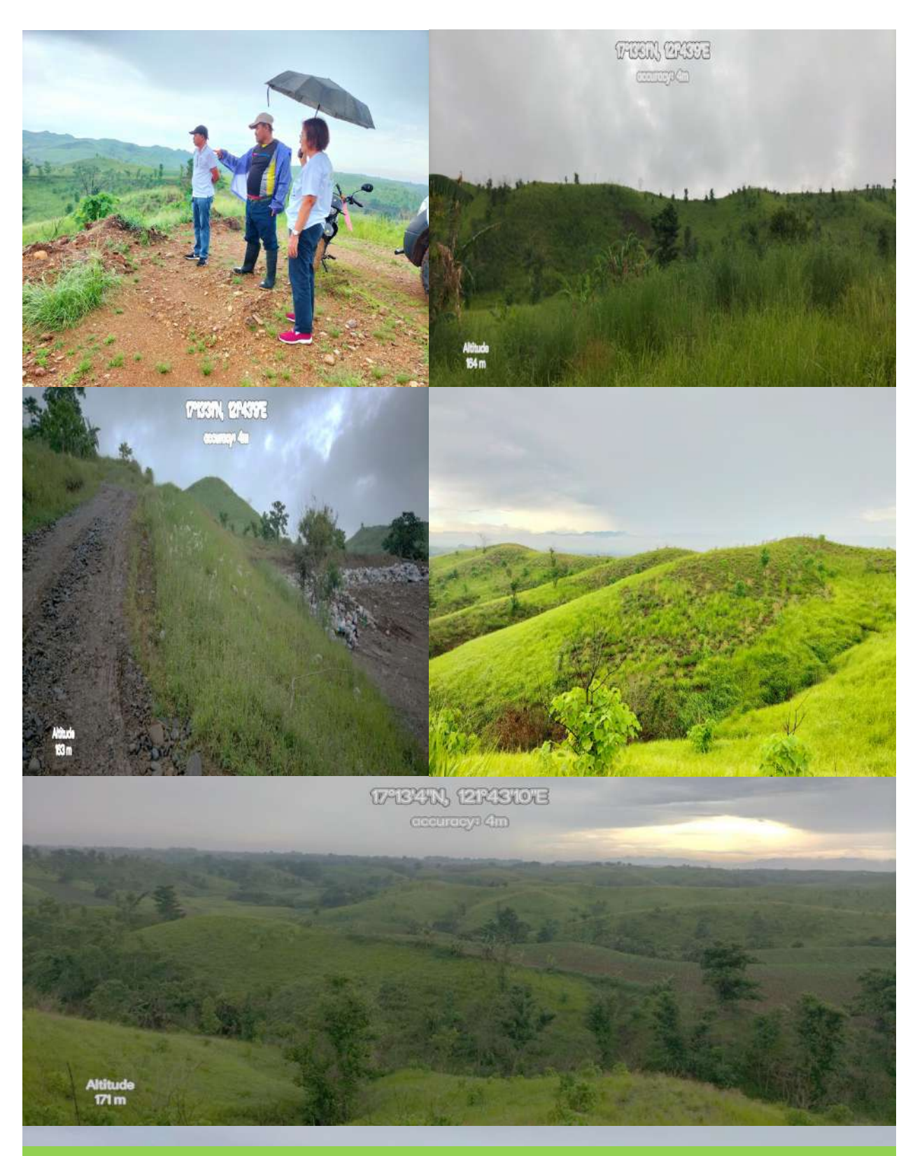
Site Inspection of the Proposed Planting Site for the One Million Trees Activity at Brgy. Carmencita, Delfin Albano, Isabela on July 5, 2024.