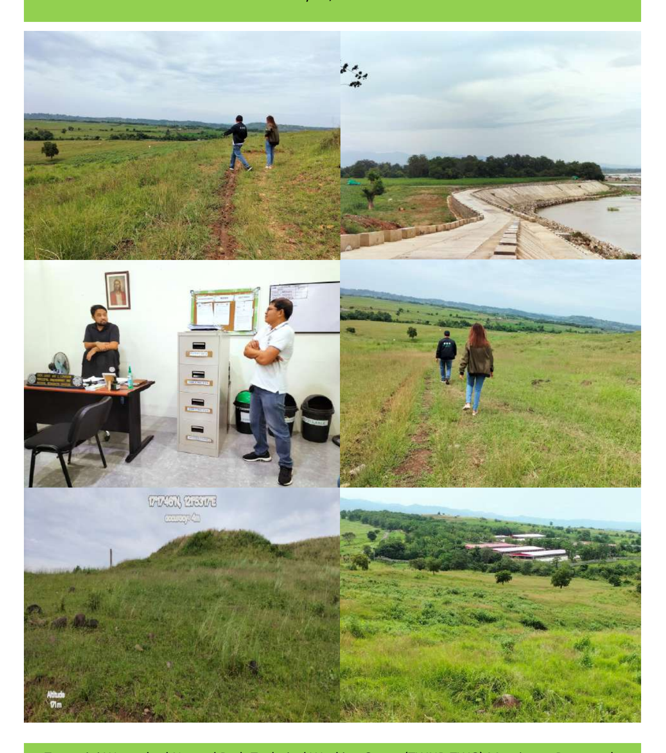
Tumauini Watershed Natural Park-Technical Working Group (TWNP-TWG) Meeting at Protected Area Management Office (PAMO) in Antagan 1st, Tumauini, Isabela on July 26, 2024.