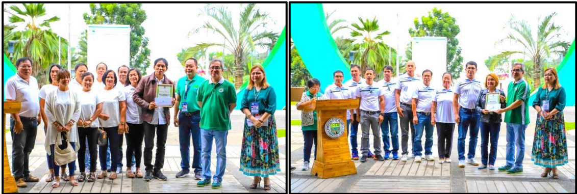
Barangay Officials of Casibarang Sur, Cabagan (Left Photo) and Gappal, Cauayan City (Right Photo) during the awarding ceremonies

The eight (8) non-winning barangay-entries awarded with consolation prizes amounting to Ten Thousand Pesos (₱ 10,000.00) each were the following: