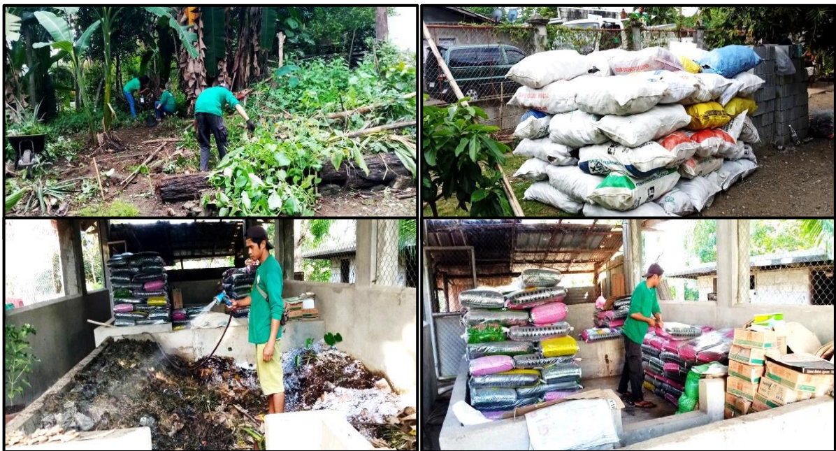
Activities in the Vermi-composting Facility

Commercial Sand and Gravel (CSAG) – As of January 31, 2020, this office received Eight (8) CSAG Permit Applications from the different quarry locations within the province with corresponding administrative/processing fees collected by the Provincial Treasurer’s Office amounting to Seven Hundred Twenty Five Thousand One Hundred Twenty (Php725,120.00) pesos only.