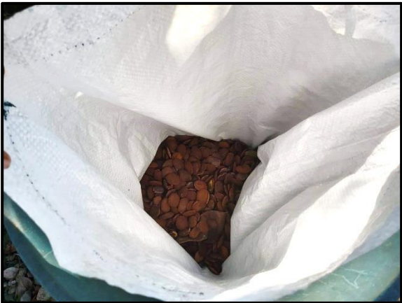
Seeds of Ipil ( Intsia bijuga ) collected from the mother trees located at the back of ENR Office.

There are six (6) laborers hired to conduct regular nursery activities augmenting the technical personnel assigned in the Provincial and Clonal nurseries.