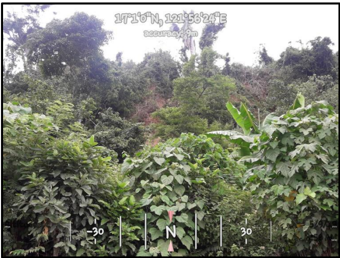
Portion of the area where massive soil erosion occurs.

In coordination with the Local Government Unit of Benito Soliven thru their Municipal DRRM Officer, this Office conducted site evaluation on their proposed area for Riparian Rehabilitation at Barangay Yeban Norte, Benito Soliven. Together with the MDRRM Officer, her staff and the Punong Barangay of Yeban Norte, we proceeded to the area briefing us that the site is one of the identified landslide prone-area in the municipality due to the uncontrollable farm tilling at the upper portion. Accordingly, efforts has already been initiated to stabilize the soil erosion thru tree planting however, those were still not enough hence requested for the assistance of the Provincial Government thru the ENR Office for the rehabilitation of a 10-meter buffer zone between the farm area and the cliff with a length of 2.5 kilometers by planting bamboo propagules.