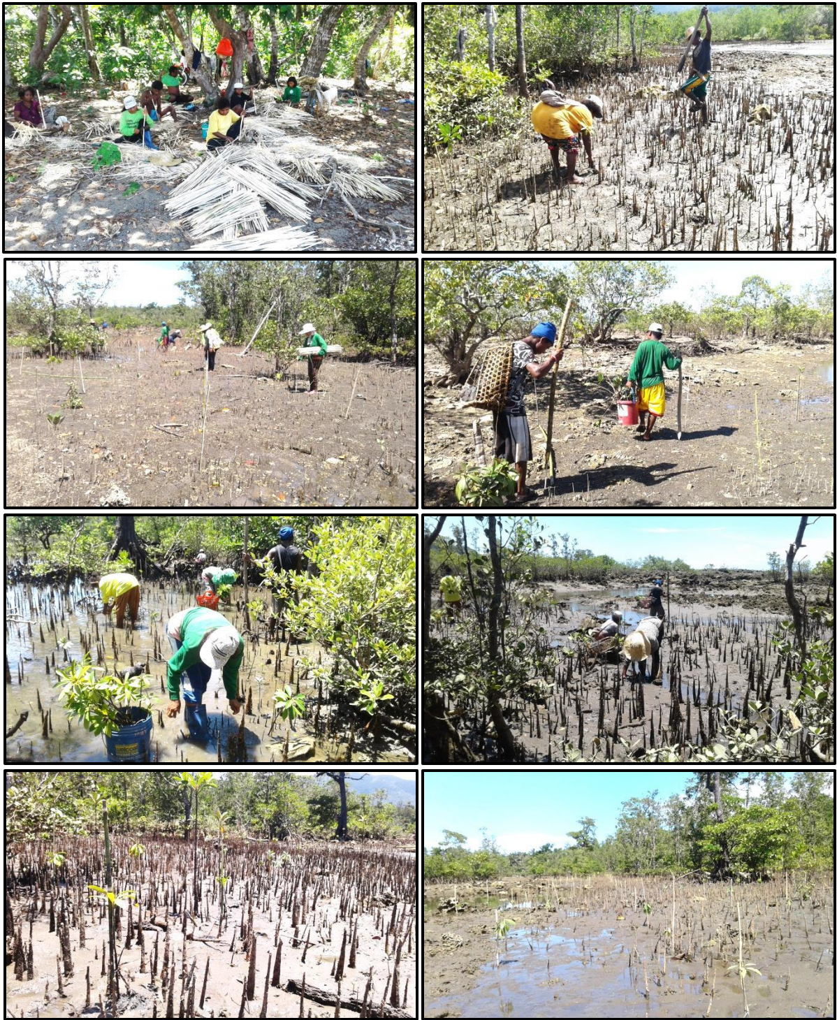
Some of the photos taken in the implementation of the 2-hectare Mangrove Rehabilitation Project at Barangay Reina Mercedes, Maconacon, Isabela

As committed, the contracted Job Order worker, with the supervision of the LGU counterpart, implemented the site preparation and planting of the mangrove rehabilitation project last June 3-8, 2019. A total of 5,000 seedlings of bakawan sps. were planted in patches totaling to 2-hectares mangrove area which accordingly were damaged by the previous typhoons.