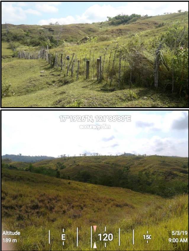
Photo of the proposed area for Reforestation.

In coordination with the Municipal ENR Officer, this Office conducted site evaluation of the proposed area for Reforestation at Sitio Namnama, Barangay Santos, Quezon, Isabela. Together with the staff of MENRO, the six (6) hectares proposed area is within the 25 hectares Municipal Tree Park developed and maintained by the Local Government Unit. As observed, fences are already constructed in the periphery, wherein bamboo and Madre de Cacao cuttings were used in some portion. High survival was observed in areas within the Park which are planted with Narra, Molave and Mango. Round weeding and mulching as part of maintenance activities were evidently implemented. Hence, it was recommended that the proposed area be adopted under the Reforestation Project of the Provincial Government. Further, native tree species such as Narra and Molave seedlings shall be planted since same species within the area indicated high survival per observations.