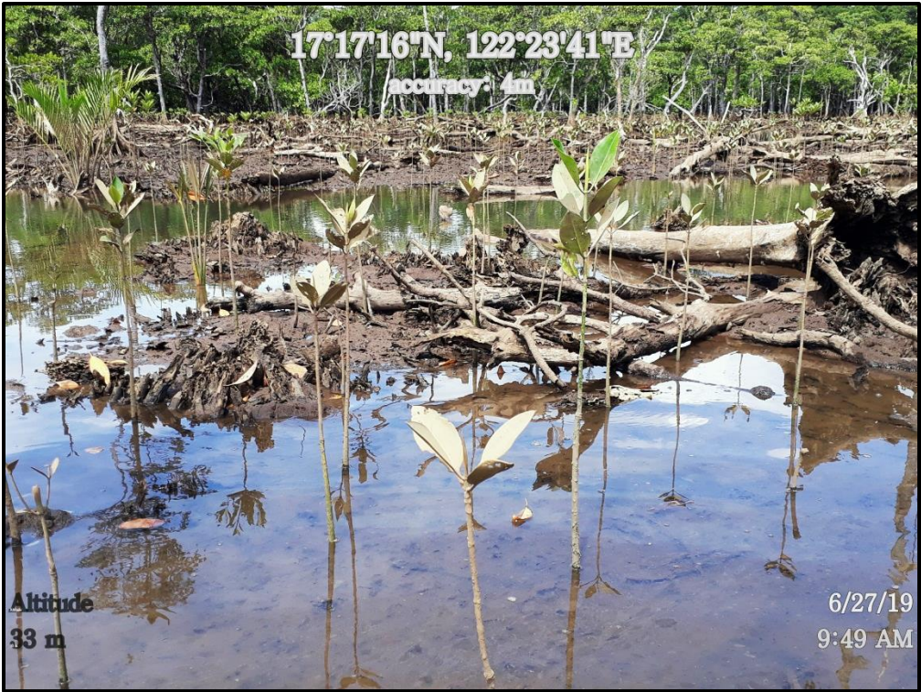
Photos of the Mangrove Rehabilitation Project established last August 2018 at Barangay Dimasalansan, Divilacan, Isabela