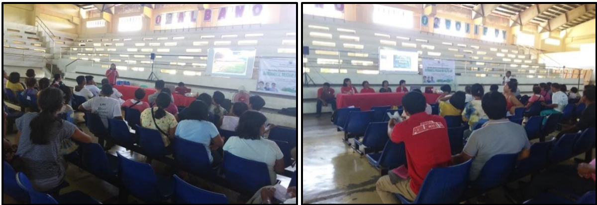
Photos taken during the IEC activity at the Municipality of Sta. Maria last June 18, 2019