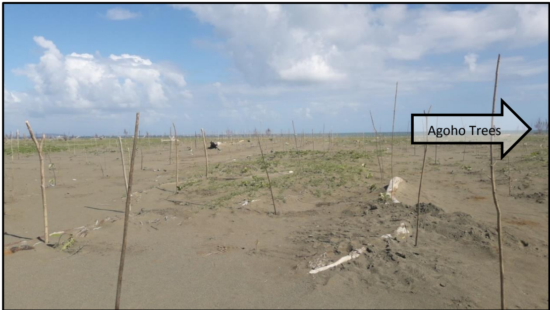
Above: Photo taken last November 11-12, 2018, three (3) weeks after establishment and almost two (2) weeks after the wrath of Typhoon Rosita. Below: Photo of the seven (7) month old plantation taken last May 27, 2019.

Following the inspection, this office also evaluated the 1-hectare plantation established last October 15-20, 2018 as part of the monitoring. The plantation is now evidently visible as the planted seedlings have improved in height. Maintenance and protection activities implemented by the LGU thru MENRO worked effectively with the current favourable weather conditions.