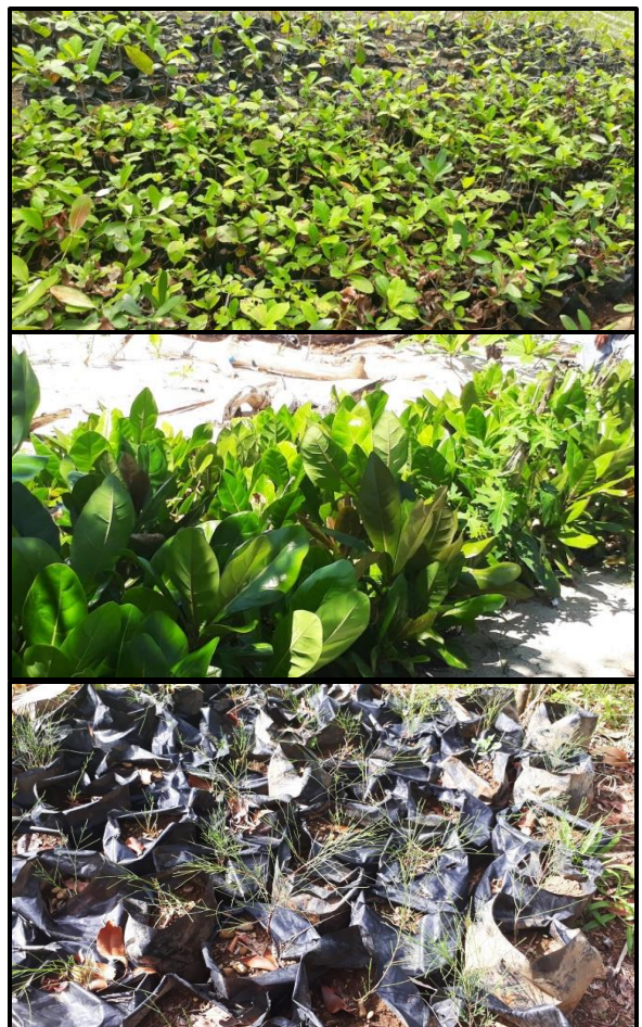
Talisai, Botong and Agoho seedlings planted in the 2-hectare project plantation.

The improvement of the initial 1-hectare Beach Forest at Sitio Sabang developed a partnership between the Provincial and Municipal LGU, and aimed further for the expansion of the plantation through the implementation of a successive Beach Forests Rehabilitation project at the said area. For this year, an additional two (2) hectares was rehabilitated thru a Memorandum of Agreement (MOA) between the Provincial Government of Isabela (PGI) and Local Government Unit of Palanan (LGU Palanan) wherein the PGI provided for the seedling requirements and LGU Palanan conducted the plantation establishment, maintenance and protection activities as their counterpart. Said MOA was initiated to further strengthen partnership with the LGU assisting them in their compliance to national requirements on CCM/A & DRRM. The approved project cost amounting to P159,500.00 represented costs for seedling procurement and field implementation, monitoring and supervision. For this project, 5,500 seedlings were procured to include the 10% mortality allowance used for maintenance. The plantation establishment activities were held on April 2-5, 2019 by personnel of LGU-MENRO. A total of 5,000 Botong, Talisai and Agoho seedlings were planted with a spacing of 2 meters x 2 meters.