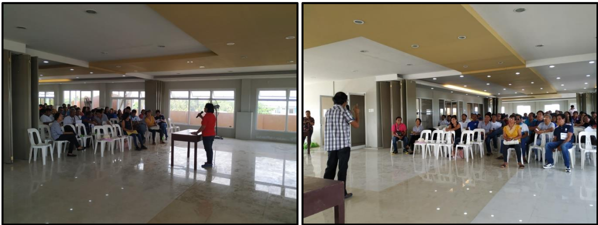
Conduct of the Pre-Orientation Workshop on April 23, 2019.

In response to the request of the Local Government Unit of Alicia, an actual WACS was conducted last April 30 to May 2, 2019. Prior to the said activity, a pre-orientation was held last April 23, 2019 to ensure that the barangays understood and shall properly execute the technicalities of collecting wastes to be used for the WACS.