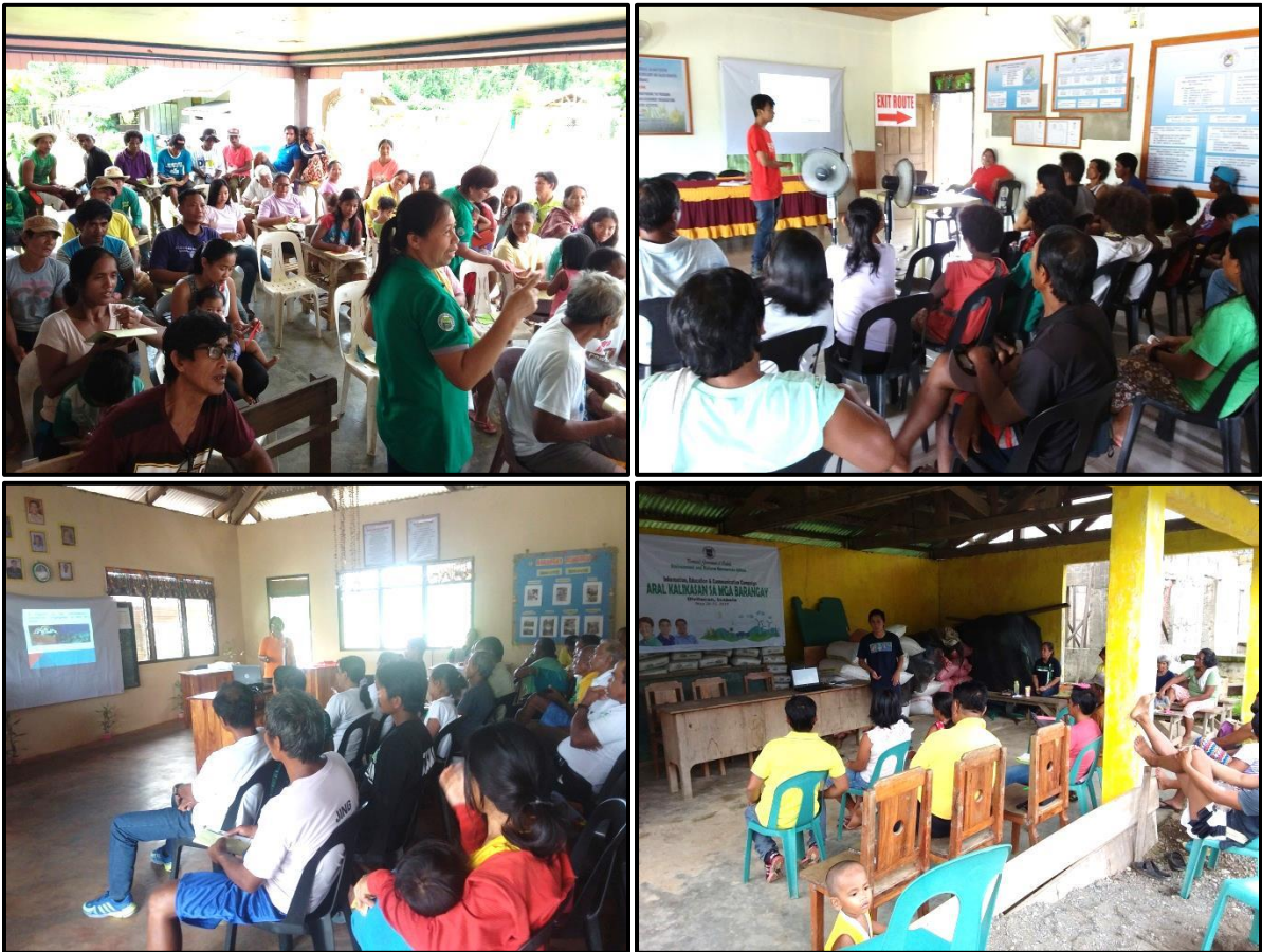
Some of the photos taken during the conduct of IEC at the Municipalities of Maconacon and Divilacan last May 27 to 30, 2019