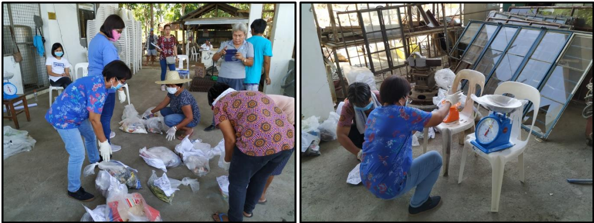
Actual conduct of WACS on April 30 to May 2, 2019.

From April to June, 2019, a total of Three Thousand Eight Hundred (3,800) Kilograms of vermicast organic fertilizer were produced at the facility with the continuous collection of organic matter. On the other hand, a total of 4,295 kilograms were released to various requesting individuals and partner agencies specifically the Office of the Provincial Agriculturist maintaining the Provincial Vegetable Nursery and DENR-PENRO.