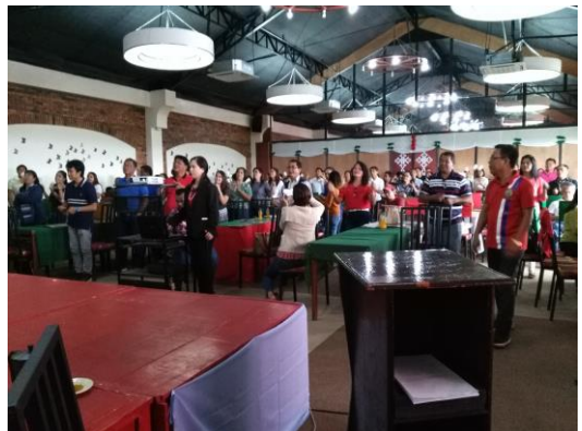
Participants from assessment offices of the 34 municipalities and the 2 component cities of the province of Isabela, during the Seminar Workshop.