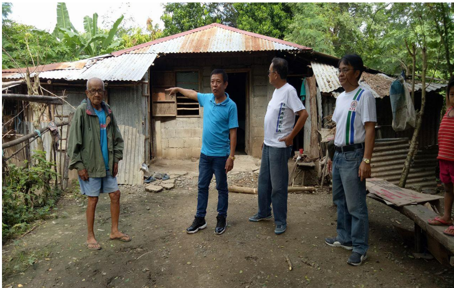
Technical staff who represents the Chairman (Provincial Assessor) and members of the Provincial Appraisal Committee (Provincial Treasurer and Provincial Engineer), together with the occupant of the residential building erected on the subject property during the conduct of ocular inspection