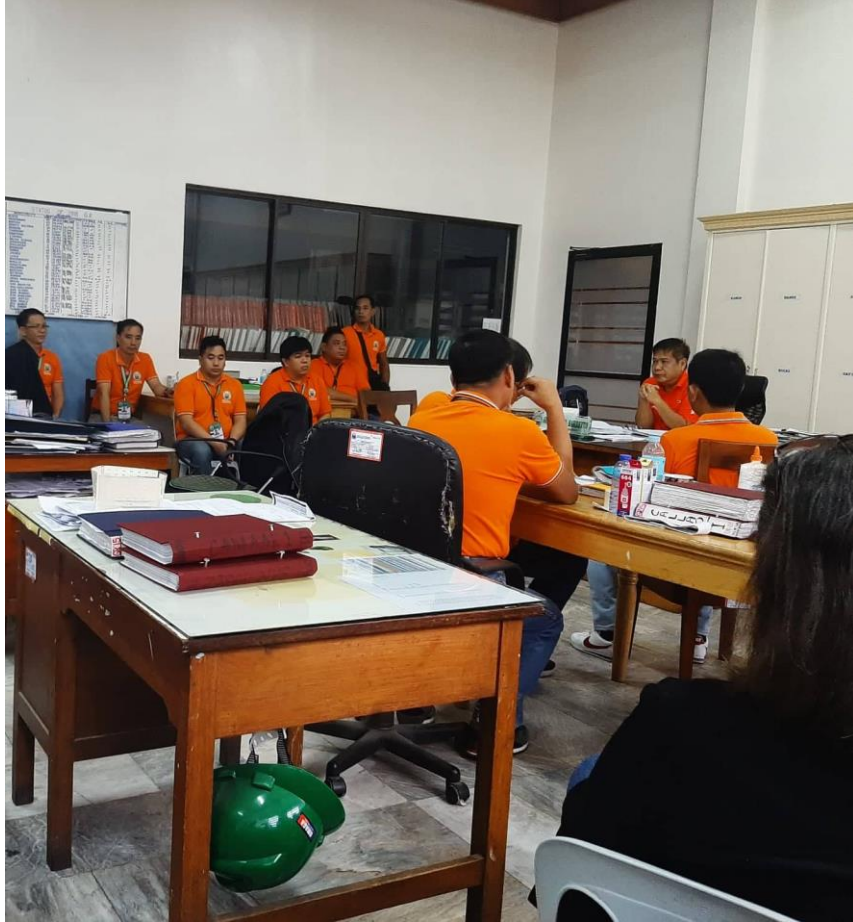
Staff meeting of Provincial Assessor's Office on November 6, 2019