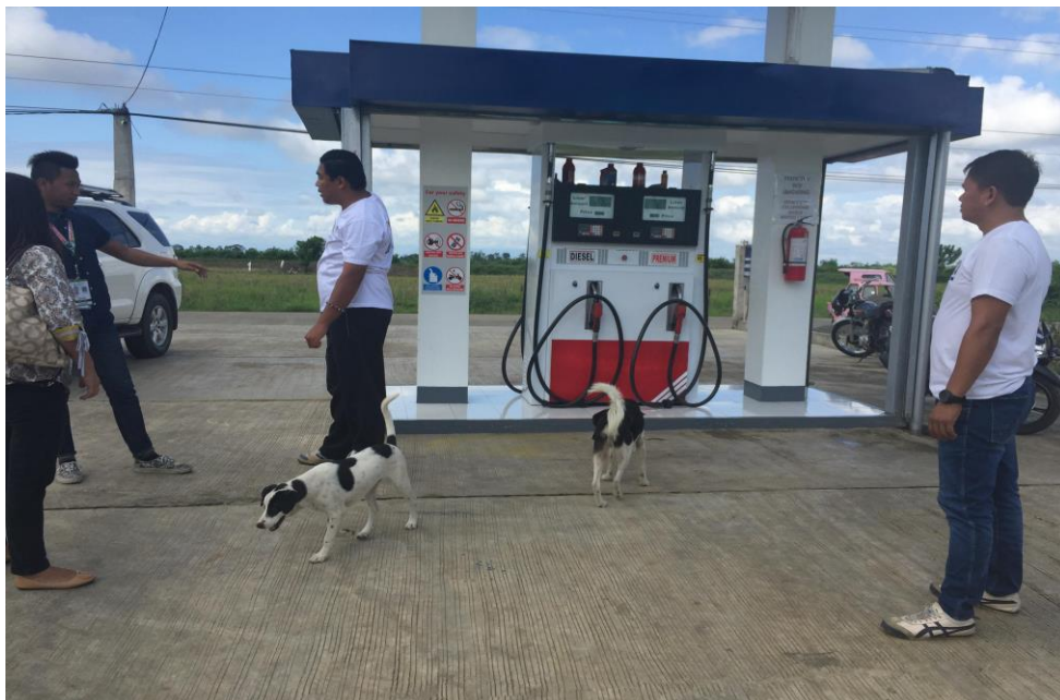
Actual field verification of Water Refilling Station and Gasoline Station at Angadanan, Isabela