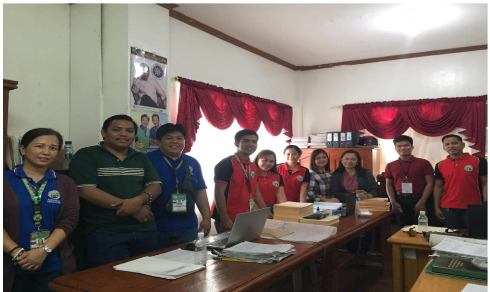
Municipal Assessor's Office of LGU-San Guillermo

Pictures taken during the Assessment Audit conducted by BLGF Regional Office- Tuguegarao City in participation of Provincial Assessor's Office personnel