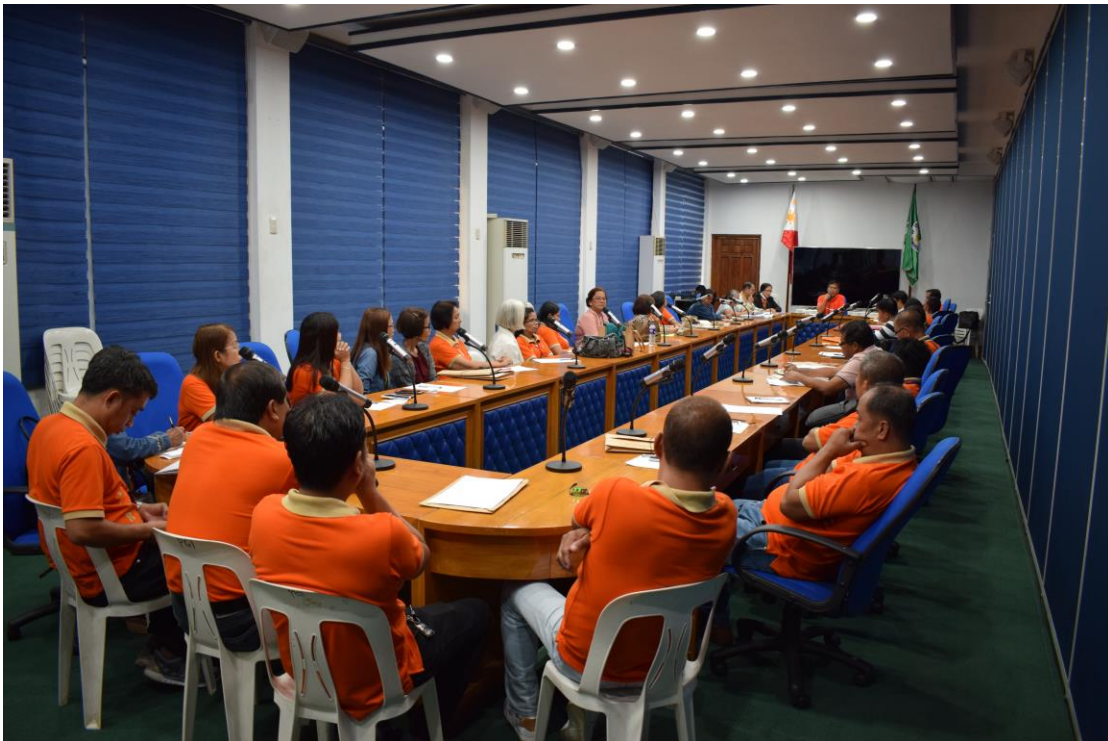
PAMAS meeting on November 6, 2019 held at Provincial Assessor's Office Blue Room, Capitol Building, City of Ilagan, Isabela