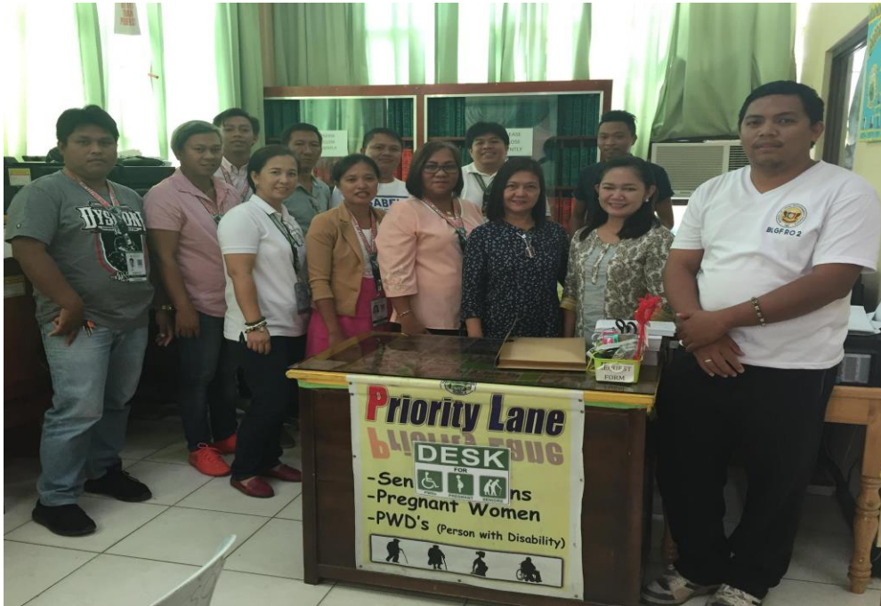
Municipal Assessor's Office of Angadanan, Isabela