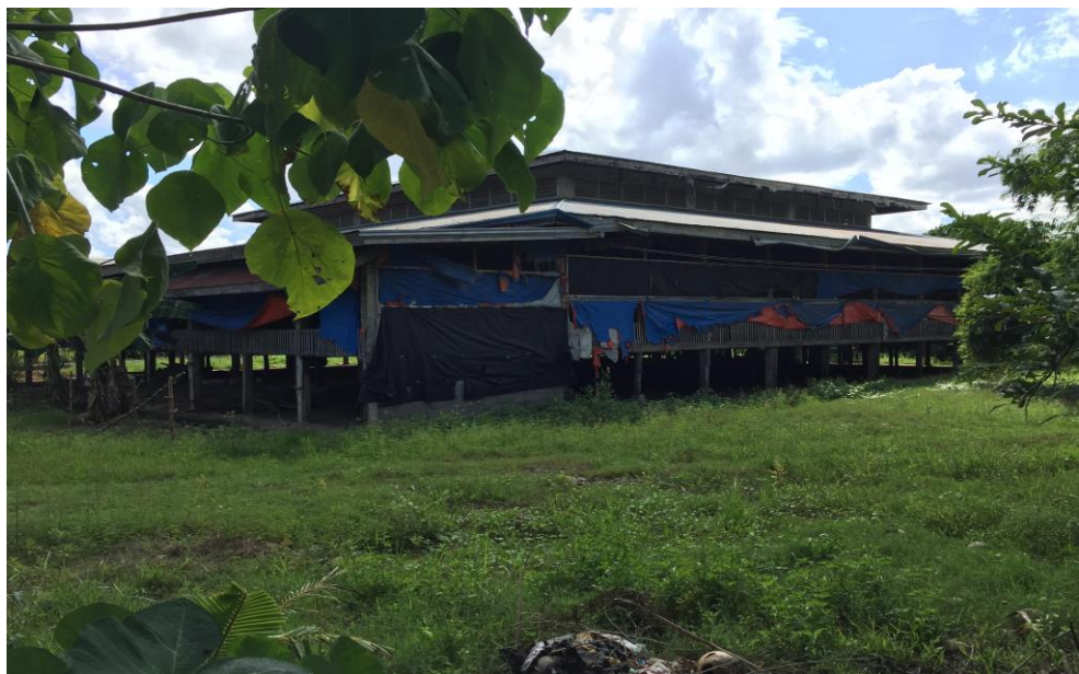
Actual field verification of Poultry at San Guillermo, Isabela