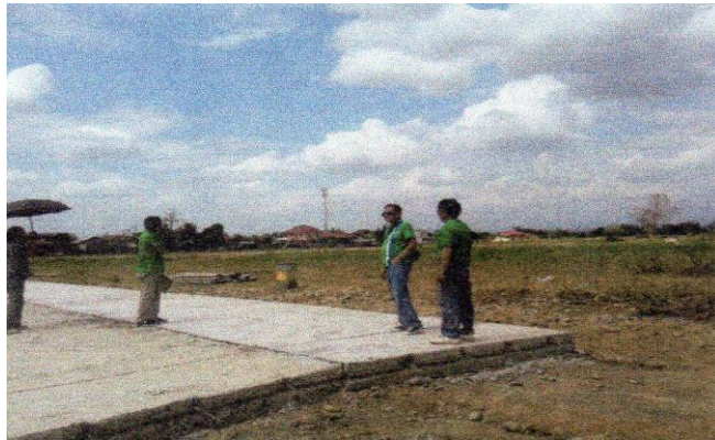
Technical staff/representatives of the Provincial Appraisal Committee conducting ocular inspection of the properties affected/traversed by the on-going construction of Diversion road with Road Right of Way at barangays' Ngarag, Anao and Ugad, Cabagan, Isabela.