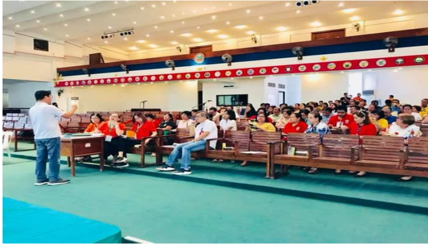
The Governor, Hon. Faustino G. Dy III, making an appeal to Local Treasurers' and Assessors' to increase locally generated income, especially on Real Property Tax