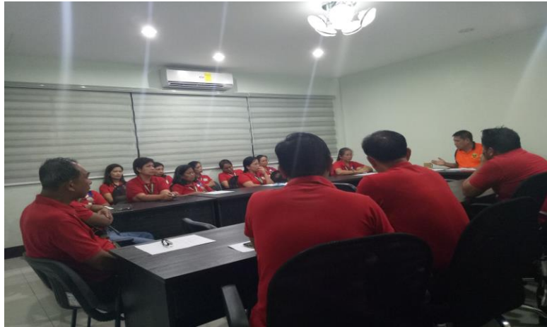
The Provincial Assessor and his staff during the meeting