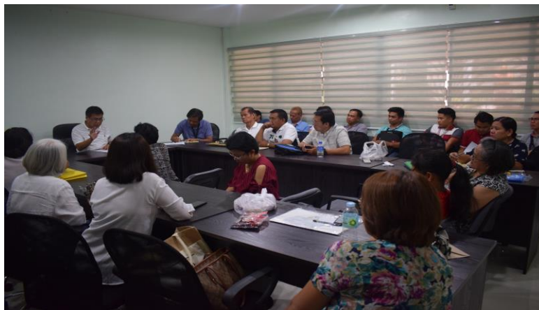
Members of PAMAS Inc., Isabela Chapter with the Provincial Assessor, presiding the monthly meeting