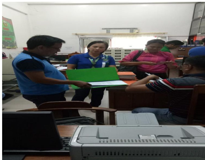
BLGF, DPWH and Provincial Assessors' personnel during the Revenue and Assessment Evaluation in the municipality of Cabagan