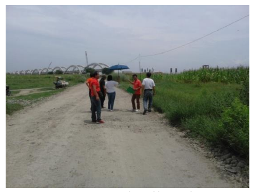
Site inspection by technical working group with Municipal Assessor's Office of Cabagan personnel on the properties that will be affected/traversed by Road Widening at Cabagan-Santa Maria Road