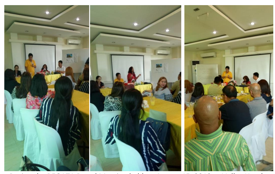
During the REGATA Board Meeting held on August 15, 2018 at Valley Hotel, Tuguegarao City