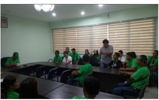
The Provincial Assessor and staff during a short meeting on August 3, 2018 during lunch break while 2018 PGI Sportsfest is on-going