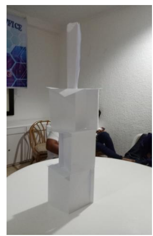
Making of tallest building out of 10 pcs. bond paper