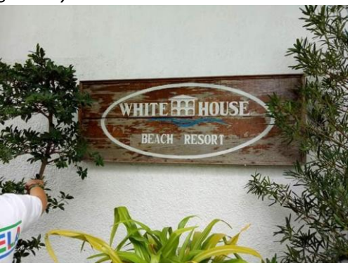
White House Beach Resort, Bauang, La Union