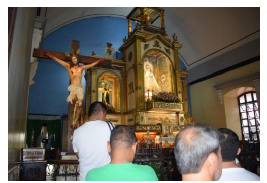
Side trip at Our Lady of Manaoag, Manaoag, Pangasinan