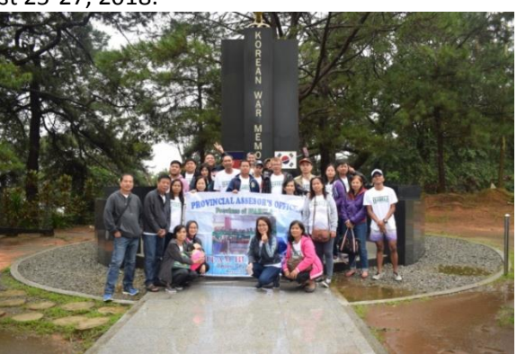
PMA Baguio City

1. Team Building of Provincial Assessor's Office at Baguio City and La Union last August 25-27, 2018.