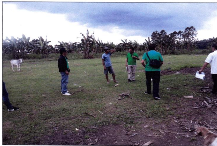
UEG, SAN MARIANO, ISA. (Feb 12, 2018)