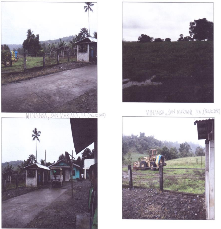
The subject property sought to be purchased by the Local Government Unit of San Mariano, Isabela, for school site expansion.