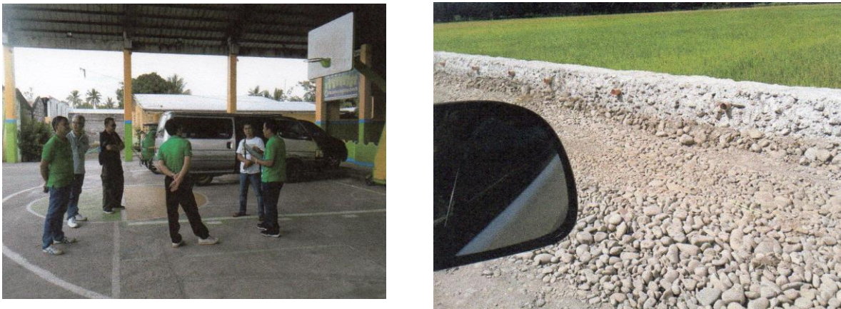
Technical staff/representatives of the Provincial Appraisal Committee (left photo) conducting ocular inspection on the site. (right photo) on-going RROW situated at Daramuangan Norte, San Mateo, Isabela.