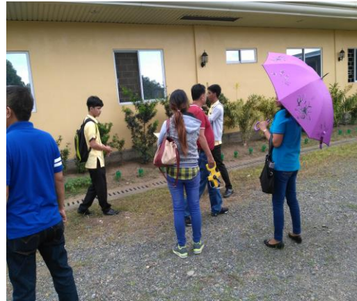
Regional, Provincial and Municipal Technical Team conducting validation on field during the evaluation in the Municipal Assessor's Office of Burgos