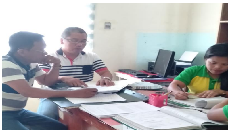
LGU-Reina Mercedes, Isabela