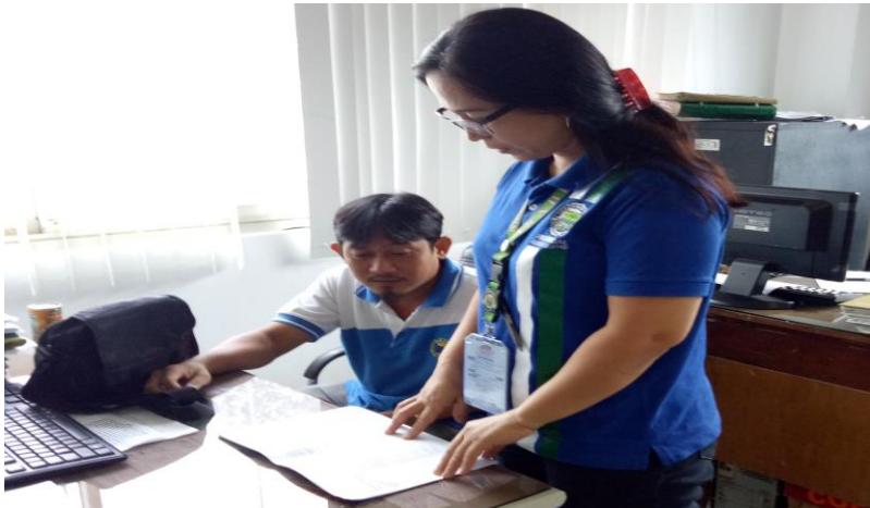
LGU-Delfin Albano, Isabela