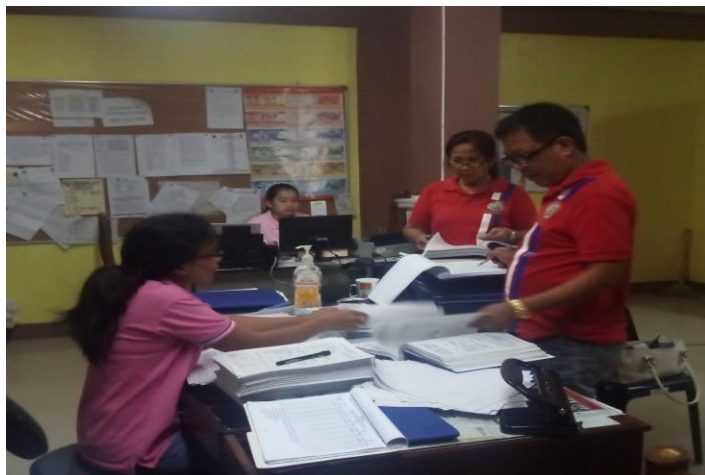
LGU-San Isidro, Isabela