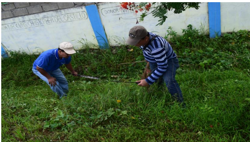
Pictures taken during the DRRM day at barangays Marana 1 st to Manaring, City of Ilagan, Isabela