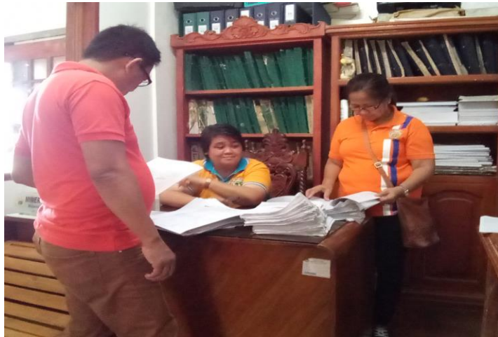
LGU San Guillermo, Isabela