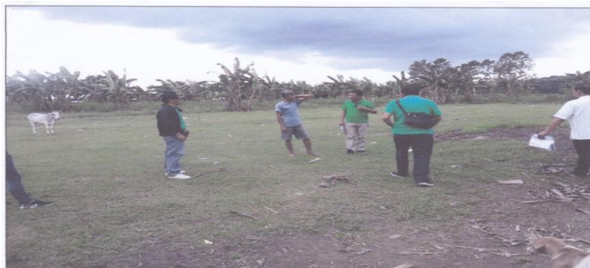
UEG, SAN MARIANO, ISA, (Feb. 12, 2018)