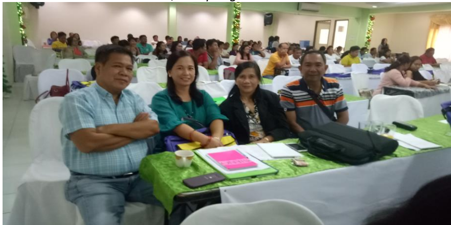
Regional Annual Evaluation and Conference/Serminar of Provincial, City and Municipal Treasurers and Assessors of Region II