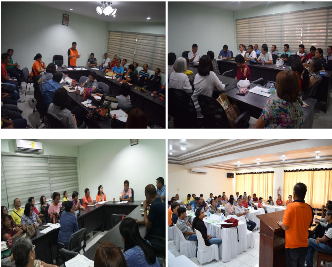
Some pictures taken during PAMAS meeting presided by the Provincial Assessor