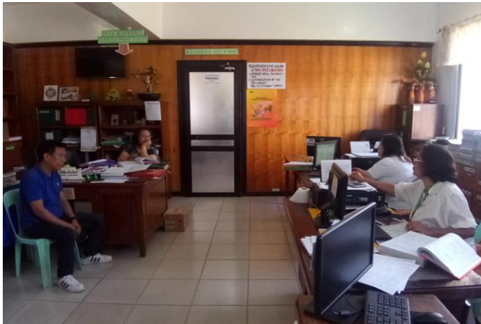
LGU- Roxas, Isabela