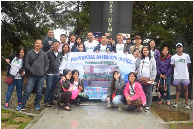
Taken during the Team Building of Provincial Assessor’s Office at San Juan, La Union.