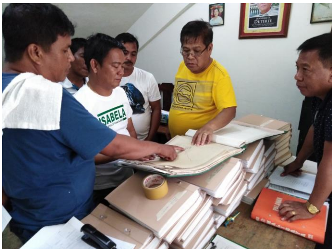
LGU- Palanan, Isabela

We have conducted visitation/inspection to the thirty (32) local assessment offices to the different municipalities including the coastal towns of Palanan & Dinapigue, of this province, in accordance with the provisions of Title Two, Book II of R. A.7160, and have extended technical assistance, supervision, validation and monitoring in the conduct of 2018 General Revision. Hereunder are some captured pictures, during the conduct of visitation.