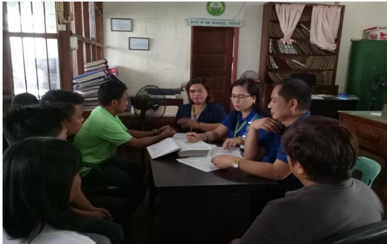
LGU-Santa Maria, Isabela