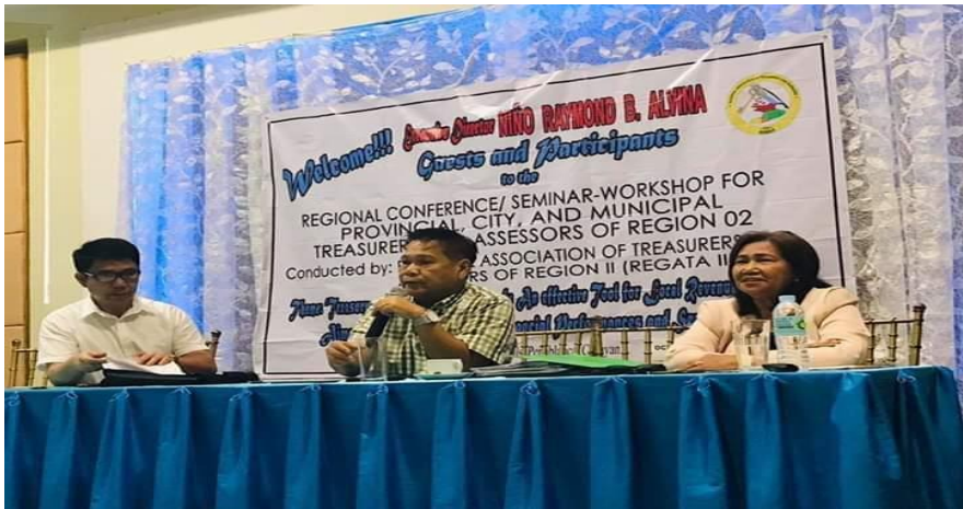
Conference/Seminar-Workshop of Provincial, City and Municipal Treasurers and Assessors of Region II