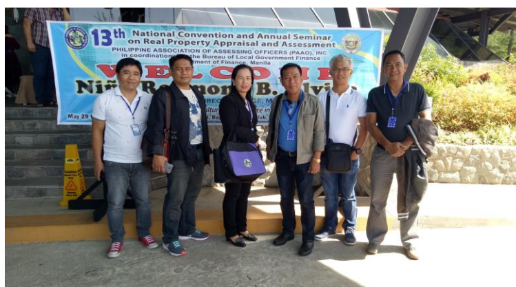
Annual Convention of Philippine Association of Assessing Officers At Baguio City