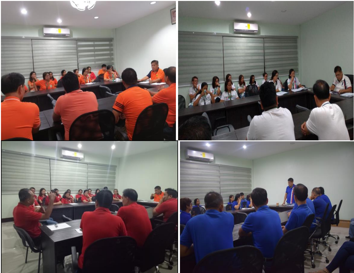
Staff meetings conducted presided by the Provincial Assessor