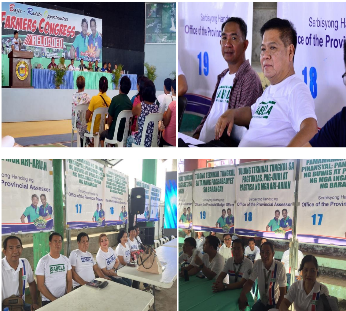
Some pictures taken during the Farmers Congress to different municipalities of the Province of Isabela