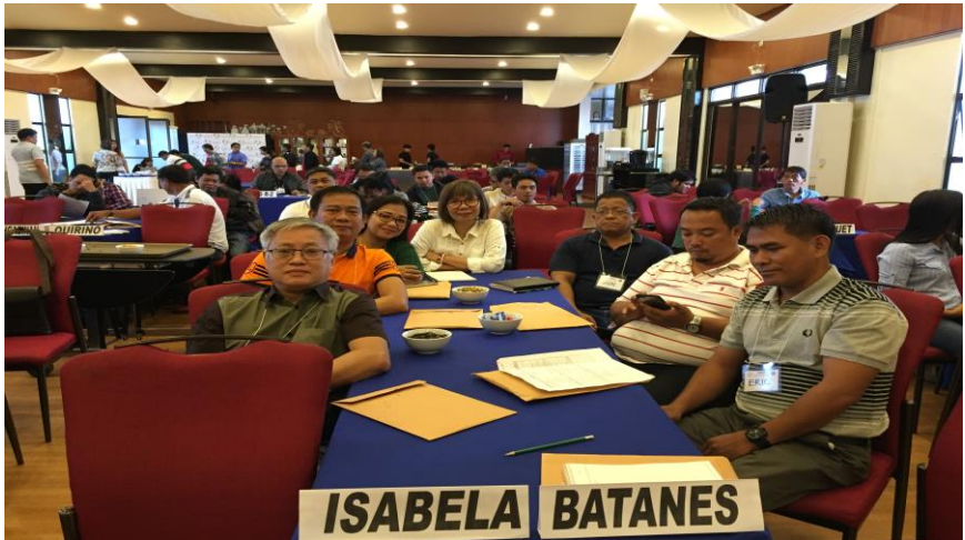
Workshop on Raod Asset Management and Promoting Transparency and Integrity held at Baguio City