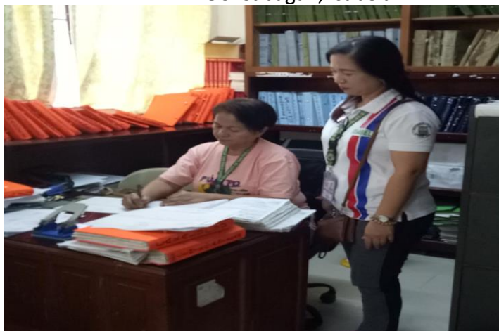
LGU-San Pablo, Isabela