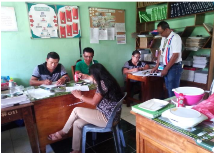
LGU- Dinapigue, Isabela