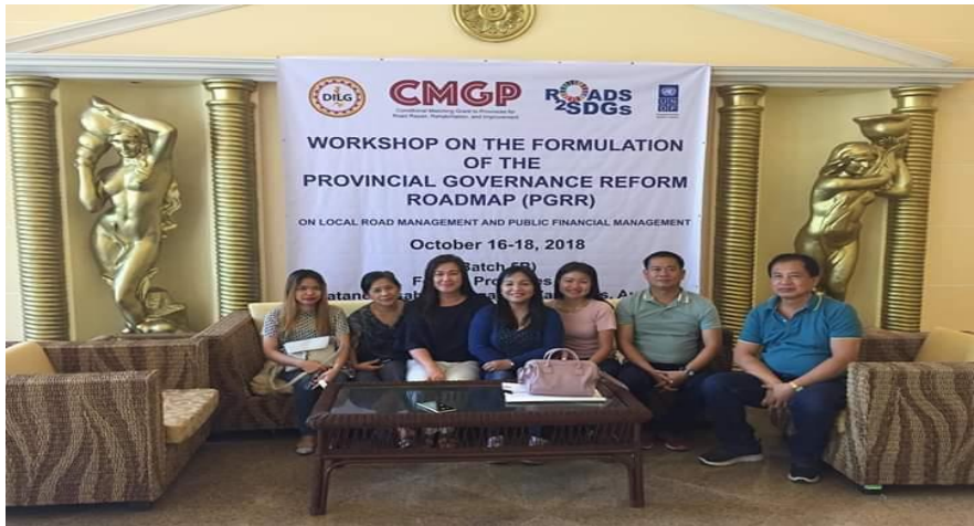
Workshop on the Formulation of the Provincial Governance Reform Roadmap At Clark, Pampanga