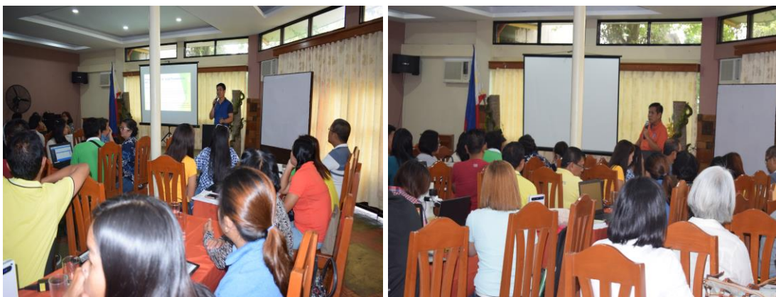
Taken during the Refresher courseon LGU Integrated Financial Tools (LIFT) System conducted by BLGF-Region II held at PiazzaZicarelli, Gamu, Isabela