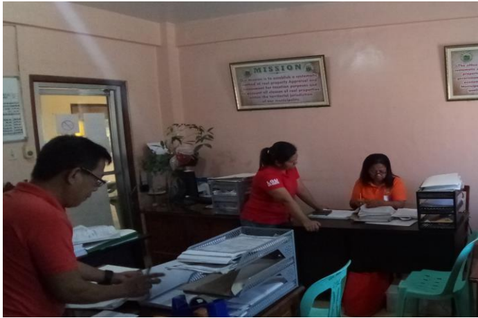
LGU-San Agustin, Isabela