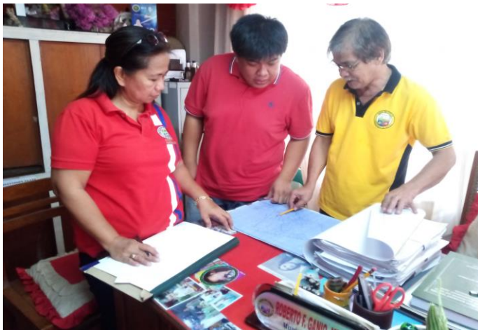
LGU- Cordon, Isabela