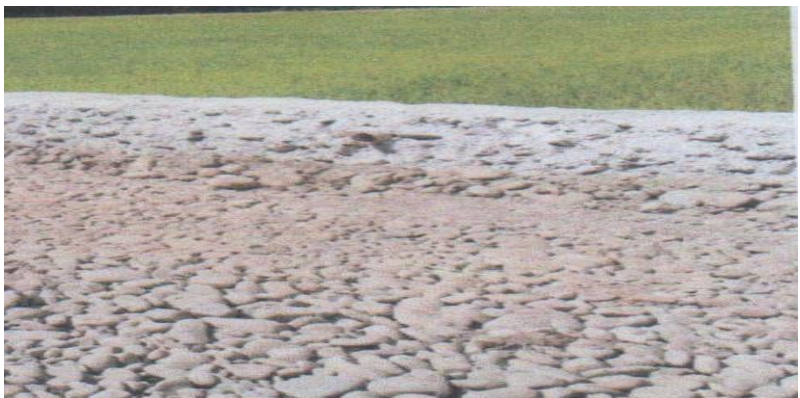
Road Right of Way at Daramuangan Norte, San Mateo, Isabela