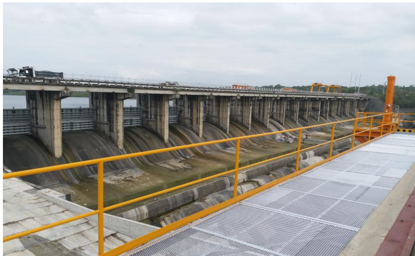
SN Aboitiz Power (SNAP) 8.5 megawatt (MW) Maris Main Canal Hydroelectric Plant