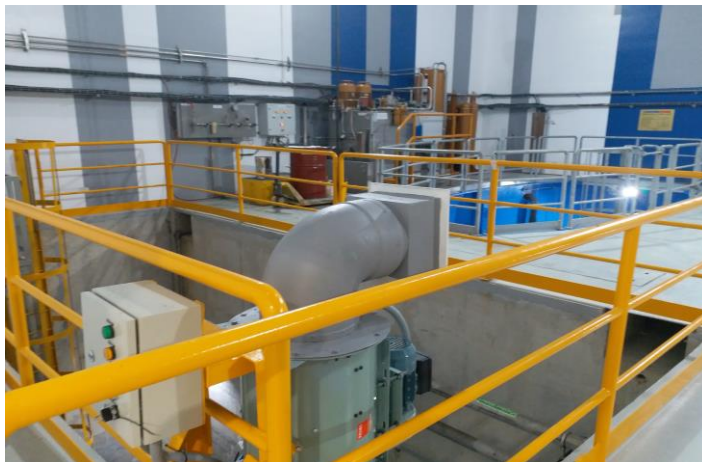
Some of the Machineries that have been inspected