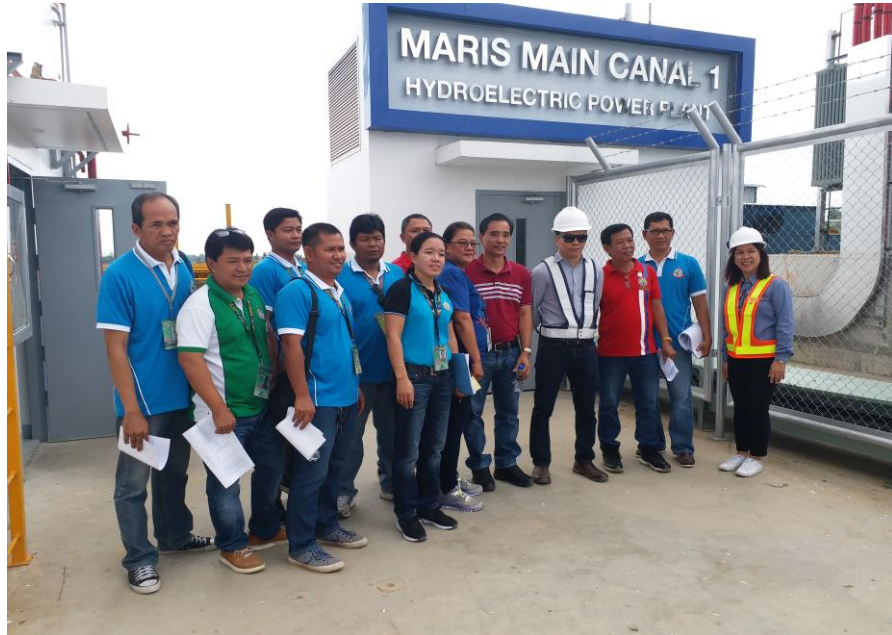
Composite Team who conducted ocular inspection on the newly installed machineries/ in the newly constructed buildings/structures of Maris Main Canal 1 Hydroelectric Power Plant