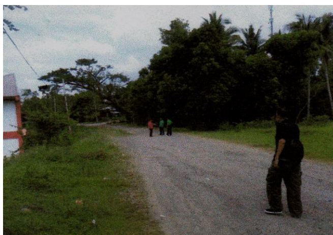
Technical staff/representatives of the Provincial Appraisal Committee conducting ocular inspection of the properties affected/traversed by the on-going construction of the By-pass and Diversion Road at Guibang, Gamu, Isabela.