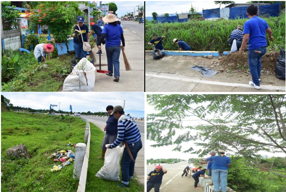
The Provincial Assessor’s Office personnel in action during the DRRM Day on July 20, 2018.