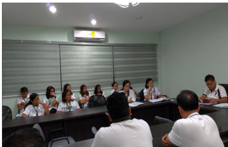
The Provincial Assessor and staff during the meeting on July 6, 2018 held at Conference Hall of the Office of the Provincial Assessor