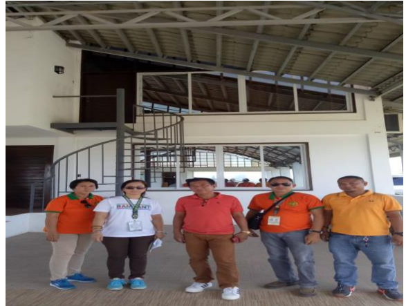
Provincial Assessor's Office and Municipal Assessor's Office personnel conducting the ocular inspection at Ballacayu, San Pablo, Isabela