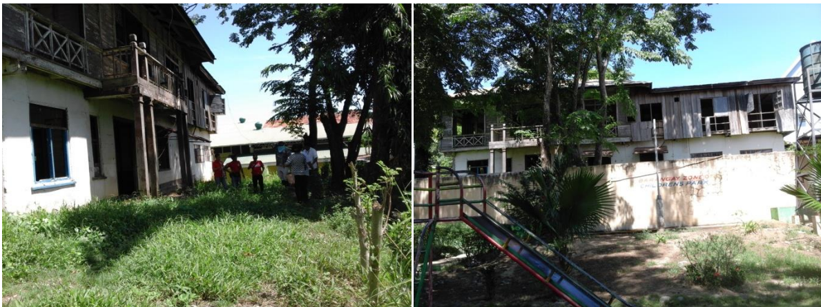
The Technical Working Group of the Provincial Appraisal Committee conducting ocular inspection on the Old Municipal Hall of San Mariano, Isabela located at Zone 1 for acquisition of LGU-San Mariano, Isabela.