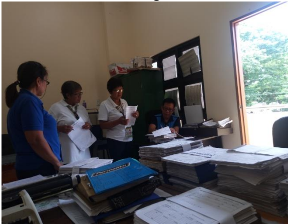
LGU- Santa Maria